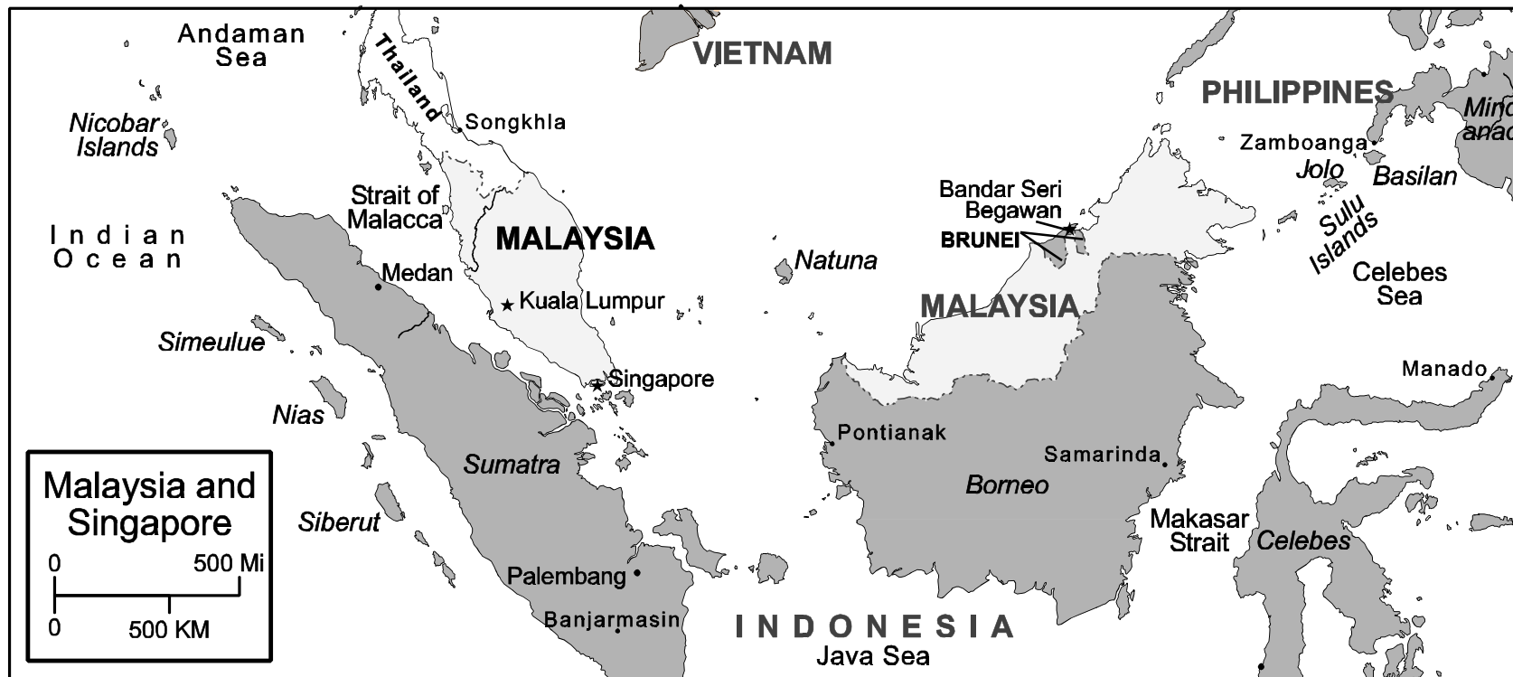
Figure 3. Malaysia and Singapore