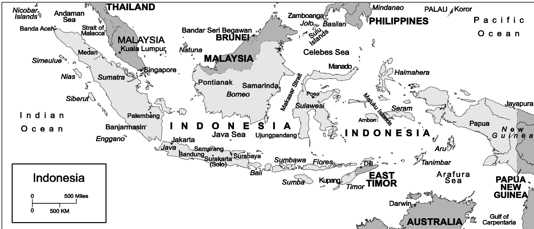
Figure 2. Indonesia

Source: Map Resources. Adapted by CRS. (M.Chin 11/02)