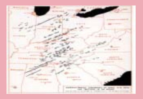
Tornado paths from April 3-4, 1974

Thirty years ago, forecasters looked at a radar scope and could only see gray splotches and had to wait for visual confirmation before issuing a tornado warning. Today, Doppler radar enables the forecaster to view full color, high-resolution radar imagery including storm motions and internal velocities. High-resolution satellite imagery enables forecasters to see details in cloud structure even before the first raindrop touches the ground. All of today's state of the art technology has enabled the forecaster to provide a tornado warning to the public with an average of 11 minutes of lead-time.