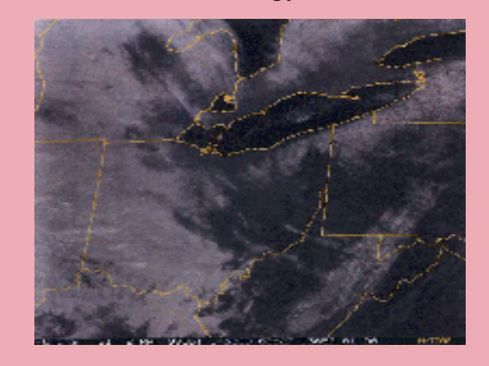
Current satelitte technology