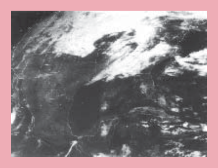
1974 satellite technology.