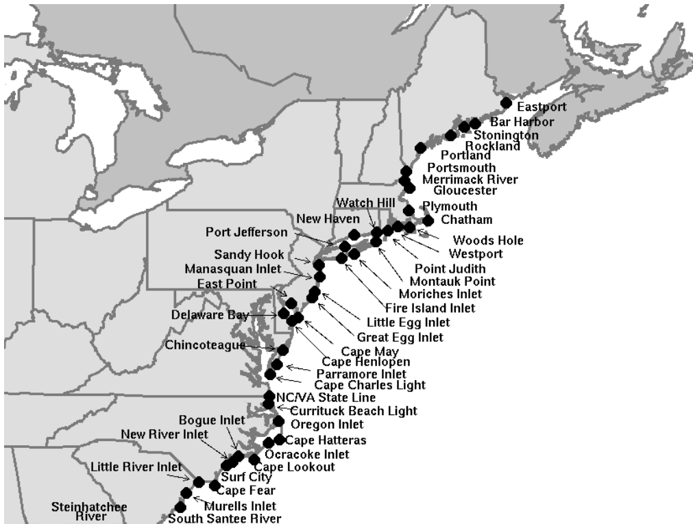
Figure B-1. Tropical Cyclone Break Points for the Northeast