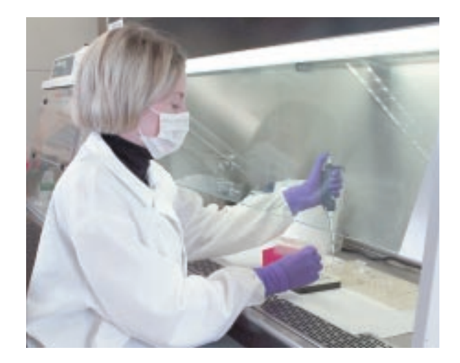
Database. This program analyzes DNA samples from unidentified human remains and from relatives of missing persons. The results are entered into the Missing Persons Indexes of CODIS.

Scientists in DNA Analysis Unit 2 use mtDNA analysis that is applied to evidence containing small or degraded quantities of DNA from hair, bones, and teeth. The results of the analysis are compared to blood and/or saliva submitted from the victims and/or suspects. The Unit examines evidence that prior to developing this technique may not have been suitable for significant comparison purposes using nDNA analysis. The Unit also manages the National Missing Persons