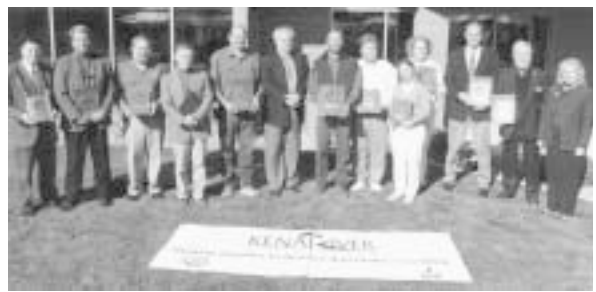
Kenai Partnership Award Ceremony

The Kenai River Resource Protection and Education Team was presented the 1999 Partnership Award at a ceremony in Kenai, Alaska on September 14, 2000. The award ceremony was held as part of the Grand Opening Ceremony of the Kenai River Center. The Center provides a focal point for a number of local agencies.