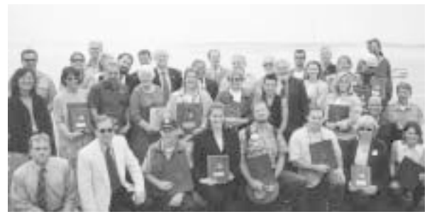
Los Osos Partnership Award Ceremony

The Partners for the Conservation of Los Osos Coastal Dunes received the 2000 Partnership Award at a ceremony in Morro Bay, California on August 11, 2000. The Partners are working to preserve and restore coastal dune ecosystems, riparian corridors, and wetland habitats of the remaining undeveloped lands surrounding Los Osos, near Morro Bay, San Luis Obispo County, California. Through the cooperative efforts of multiple agencies and citizen groups, this partnership has already preserved approximately 35 acres and is advancing the protection and management of an additional 1,200 acres. The Los Osos partners seek to increase public awareness of, and political support for, the need to conserve open space and wildlife habitat within this region.