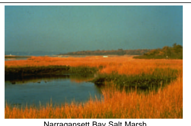
Narragansett Bay Salt Marsh

Narragansett Bay, Rhode Island, was one of the first areas in the nation to feel the effects of industrialization. At the Narragansett Bay National Estuarine Research Reserve, studies were conducted to determine the historic deposition of certain heavy metals in the high and low marshes around Prudence Island. Analysis of this data indicates a direct correlation of the accumulation of copper, cadmium, zinc, silver and lead with the increase in population and industry in the watershed. Accumulation in the high marshes is less and appears to be