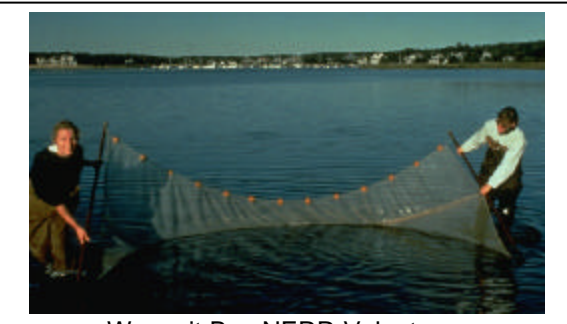
Waquoit Bay NERR Volunteers

The reserves also provide a variety of formal and informal opportunities for the public to learn about estuaries and the effect of human activities on them. Most of the reserves include interpretive centers that are open to the public and feature displays on local wildlife, reserve resources and water quality information.