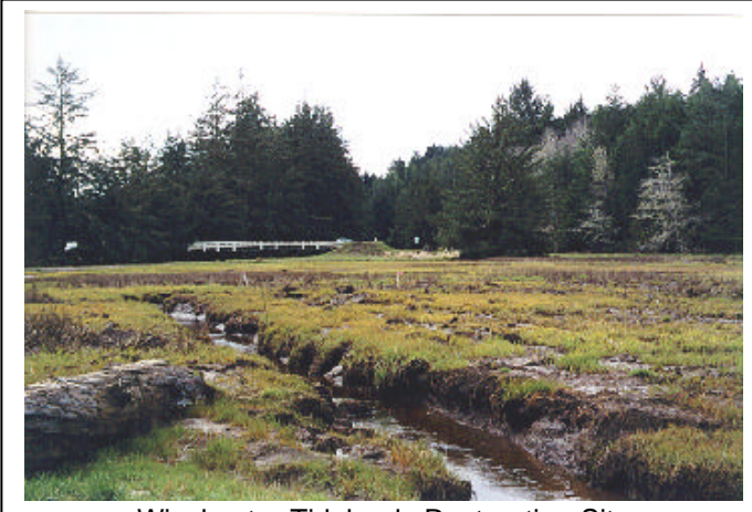
Winchester Tidelands Restoration Site

The WTRP is now in its second phase. The ecological functions of four wetland sites are being restored. The resulting changes in productivity are being quantified and described, and experimental plots are being designed to examine different techniques for developing