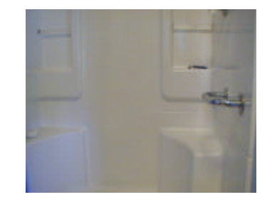
Shower with grab bars and seat.