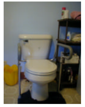
Stool equipped with grab bars.