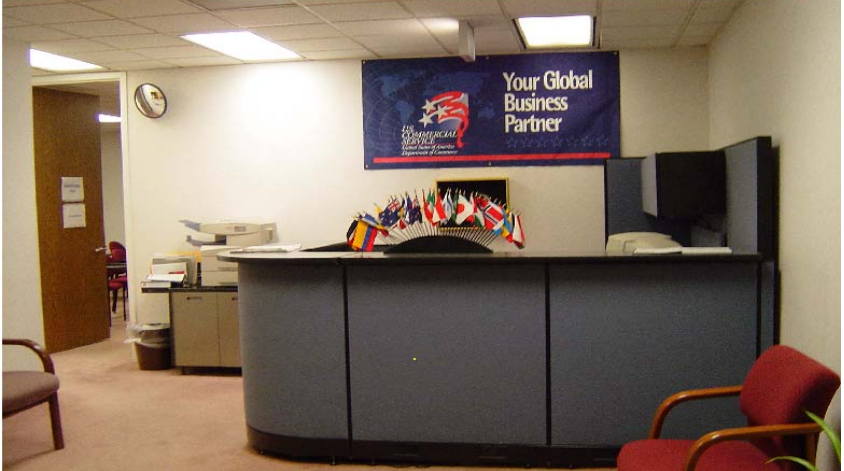
Reception area of the Chicago USEAC.

In 1994, Commercial Service opened a USEAC in Chicago. It was one of the four initial onestop shops, bringing together representatives of Commercial Service, Export-Import Bank (Ex-Im), and Small Business Administration (SBA). Since that time, the Chicago USEAC has expanded to include, as a co-located trade partner, the Global Trade and Technology Network (GTN), which is funded by the U.S. Agency for International Development.<sup>3</sup> As the primary partners of the Chicago USEAC, these trade agencies share in client counseling and referrals, outreach, event planning and program participation and promotion.