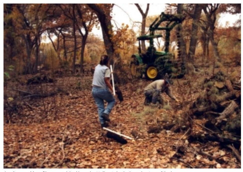
Joe Aragon, Mary Cloven, and Joel Lee plant tall-pot shrubs in understory of the bosque

Four 50-acre test plots have been identified at three different locations for a total of 12 test plots altogether. The locations are at the Bosque del Apache W ildlife Refuge, the village of