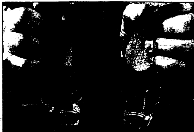
Figure 2: Available water capacity is greater with small pore size.

Soil quality with respect to available water is better for the soil from Maine (ME), because of both the internal properties and the lower evapotranspiration deficit.