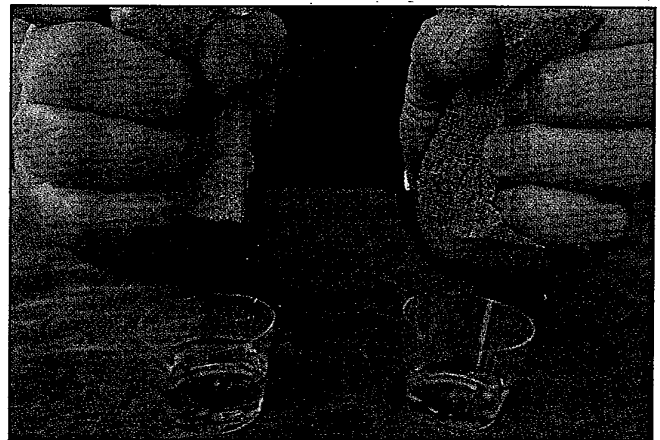
Figure 2: Available water capacity is greater with small pore size.

Soil quality with respect to available water is better for the soil from Maine (ME), because of both the internal properties and the lower evapotranspiration deficit.