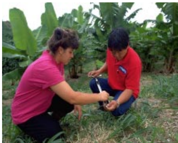
Testing Soils on Banana Plantation

Several sources of information were used to generate the list of barriers and strategies, including field experience, research articles, and interviews with staff members from the conservation partnership in the Northern Plains, Northeast, Southeast, and South regions. This technical report can serve as a guide for the conservation partnership, especially those who work at the field level. While many barriers and strategies are presented, the list is not exhaustive. Unusual geographical locations, unique cultures and sub-cultures (e.g. Pacific Basin, Amish, Latino growers, African American producers, etc.), specific site conditions, and particular characteristics of different producer groups are among the factors that warrant more customized analyses and actions.