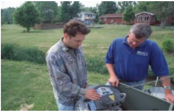
Dairy Farmer Discusses Manure Management

Promote the use of NRCS' Field Office Technical Guide (FOTG) as the primary resource for practice standards when working in cooperation with the state technical committee and the conservation partnership. Visit the web site http://www.nrcs.usda.gov/technical/efotg . Click on your State; Section IV contains conservation standards.