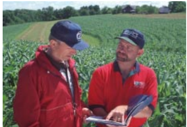
Monitoring for Non-Point Source Pollution

and agency representatives. The primary objective of the course is to increase understanding of the eight elements in a CNMP. Additional information and materials on CNMP training through the National Pork Producers Council, including a curriculum guide and video, can be obtained from http://www.porkboard.org/PorkStore/envnutrmgmt.asp or visit their home page http://www.porkboard.org/Home/default.asp .