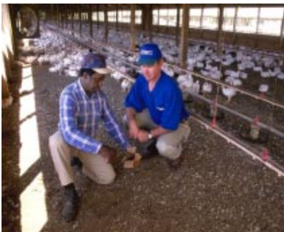
Understanding Benefits of Composting Chicken Manure

In cooperation with the local Extension Service, develop information on the need for soil testing. Some methods to distribute this information could be through the use of field days or workshops to demonstrate appropriate soil-sampling techniques. When working with LRF and/or minority producers, use “one on one” technical assistance to demonstrate where to take the soil samples within the operation, and how to interpret and apply test results. It may be appropriate to use some existing cost share programs (e.g., EQIP) to help defray the cost of a soil test, given limited resources. 2