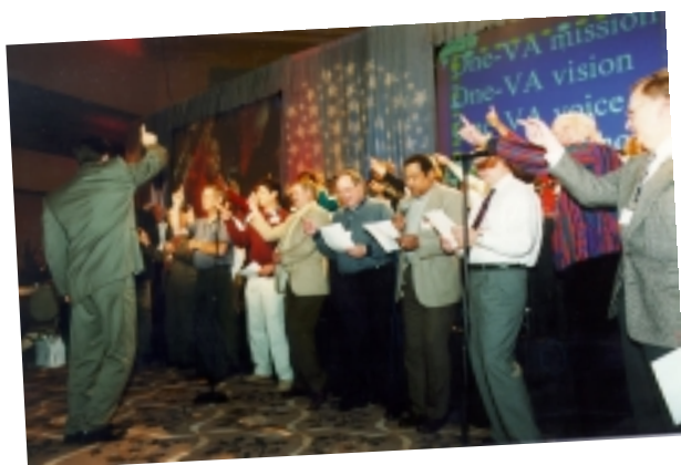
Members of the Project Management Group perform their song, the "One VA Doo-wop" (to the tune of "Tears on My Pillow") as a prelude to presenting their action plan to conference participants.

Conference participants played the role of investigative reporters, conducting both overt and covert assignments to determine which concepts among those identified at the four regional conferences should become national priorities. The