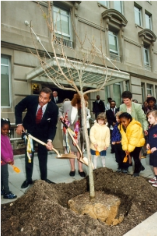
Secretary of Veterans Affairs Togo D. West, Jr., joins children from the US Kids day care center to plant a tree outside VA Central Office. The day care center is funded in part by VA recycling funds.

T he first Earth Day of the new century also marked the 30 th anniversary of the event, and VA facilities across the country used the occasion to highlight the Department's environmental accomplishments and to participate in local clean-up efforts and other observances. Tree-plantings, environmental awareness campaigns, aluminum can collections and community beautification projects were among the activities VA facilities organized or participated in to observe Earth Day 2000 last month.