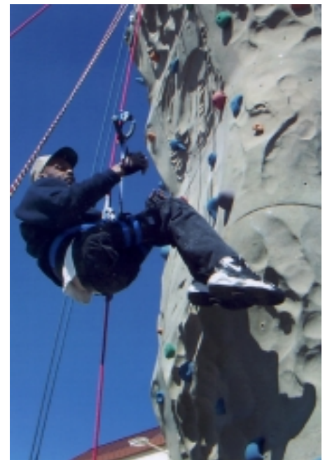
Nearly 300 participants attempted to conquer the rock-climbing wall at this year's Clinic.

One of the activities growing in popularity at the Clinic is the rock-