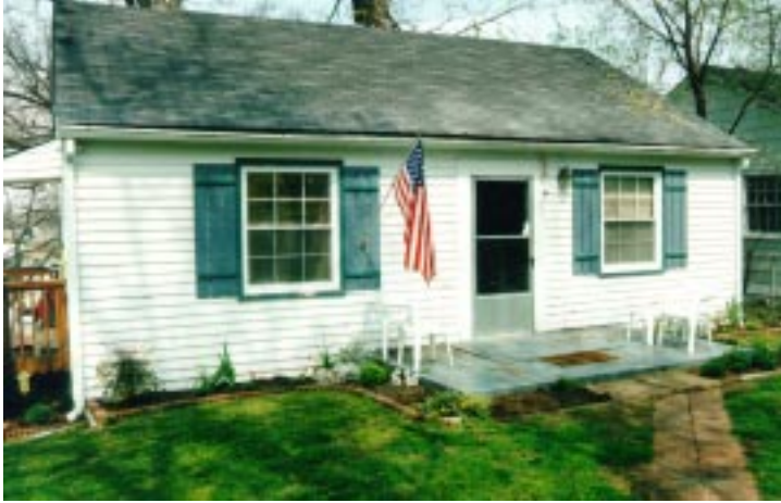
A group of women veteran VA employees in Nashville, Tenn., helped turn a dilapidated house into this shelter for homeless women veterans.

W hen Angel's Landing, a shelter for homeless women veterans in Nashville, Tenn., opened its doors in April 1999, it was the first facility of its kind in the state. But that's not the only reason the facility is unique. Its existence is due in large part to the efforts of a group of women veteran employees from the Nashville VA Medical Center, VA Regional Office and community volunteers working together as the Nashville Women Veterans Network.