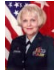
Alliance in VISN 8 (Bay Pines, Fla.) and deputy surgeon general in the Army National