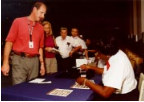
Employees wait in line at the Murfreesboro, Tenn., VA Medical Center to purchase the Alvin C. York commemorative stamp.

The San Antonio VAMC hosted a stamp unveiling ceremony on June 20 in conjunction with what would