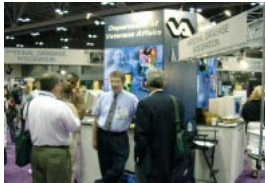
VA exhibitors and private vendors manned more than 170 booths at the EXPO in the Austin Civic Center, displaying a wide range of cutting-edge information technology products and services.

"Information technology is one of the most important tools available to meet the demands of the coming millennium. We must be vigilant in our efforts to discover new and