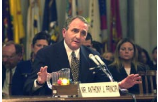
Principi answers a question during his confirmation hearing.

At his confirmation hearing before the Senate Veterans' Affairs Committee on January 18, Principi made it clear that improving the benefits claims processing system will be his top priority. "Many veterans have lost faith in VA's ability to fairly and promptly decide their claims for benefits," he said. "Not without reason. It takes too long to decide a claim. And the error rate remains too high."