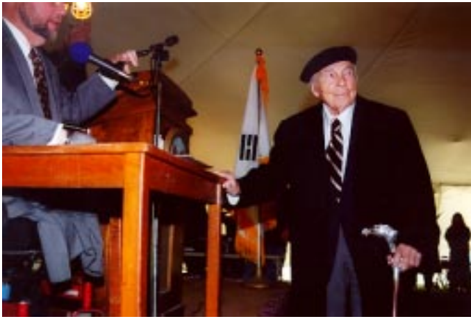
A ceremony held on the grounds of the Martinsburg, W.Va., VA Medical Center to present Korean War service medals to 65 veterans on Veterans Day opened with the presentation of a World War I medal to 99-year-old former POW Frank Buckles.