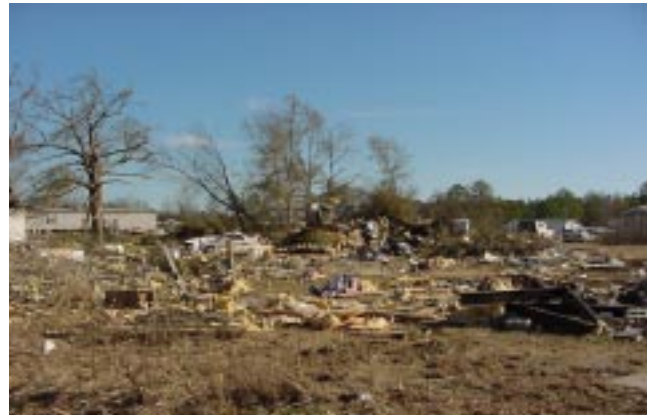
A view of the devastation at the Bear Creek Mobile Home Park.