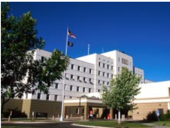
Grand Junction VAMC serves veterans from western Colorado and eastern Utah.