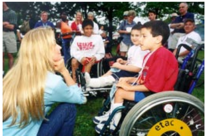
Actress Bo Derek, honorary chairperson of the Games, talks with disabled children at Kids' Day.