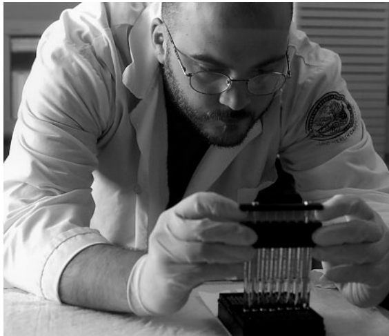
Though VA investigators focus on improving health care for veterans, all Americans have benefited from their breakthroughs.