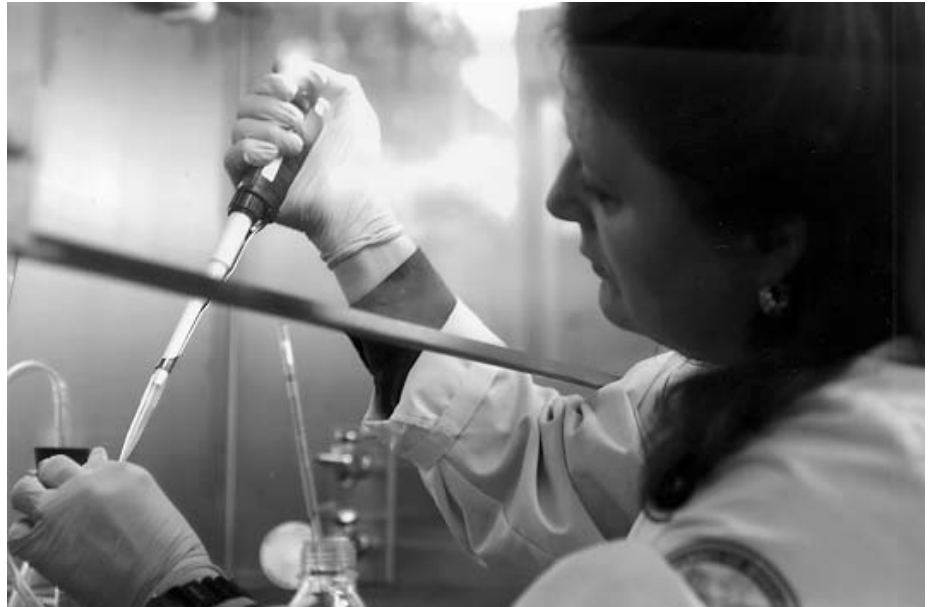
More than 3,800 VA investigators across the country conduct medical, rehabilitation and health-care delivery research.

Of heart-attack patients medically considered "ideal candidates" for angiotensin converting enzyme (ACE) inhibitors, nearly 71 percent of patients at VA hospitals received the