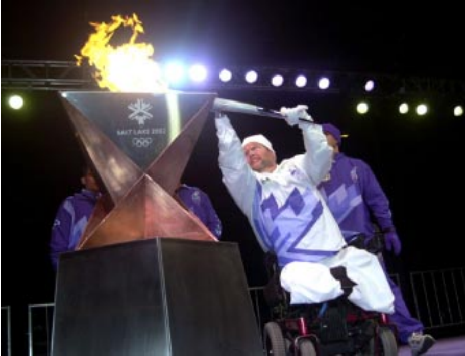
THE (MARTINSBURG, W.VA.) JOURNAL