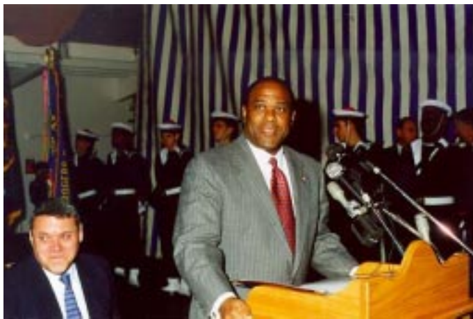
The final public ceremony honoring American veterans who landed at Normandy and helped liberate France during World War II was held Dec. 13 aboard a French helicopter carrier docked in Boston. About 200 World War II veterans received Special Diplomas from the French Consul General. VA Deputy Secretary Leo S. Mackay Jr., Ph.D. , above, represented the United States at the ceremony.

be replaced, and these replacements were going to be pretty expensive," said Minnema. The ESPC made it possible to replace the 25-year-old high-pressure steam boilers and address less critical infrastructure areas that were aging or needed maintenance, such as air compressors, corroding cooling coils, and electric motors. The task that provided the most energy savings was the lighting retrofit. More than 250,000 light bulbs were exchanged for high-efficiency bulbs and lamps. Light controls were installed in areas where the need for light was not continuous. The next energy-efficient move for the medical center is to address water cost-saving measures that include cooling coil replacement, steam distribution