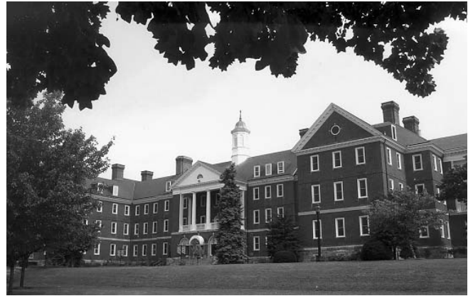
The 29-bed Alzheimer's unit specializes in the treatment and rehabilitation of veterans with that disease and other forms of dementia.

Of all the various elements within the Alzheimer's unit, perhaps the most significant is the program's reliance on family involvement. Most families visit their loved ones often, spending time together in the