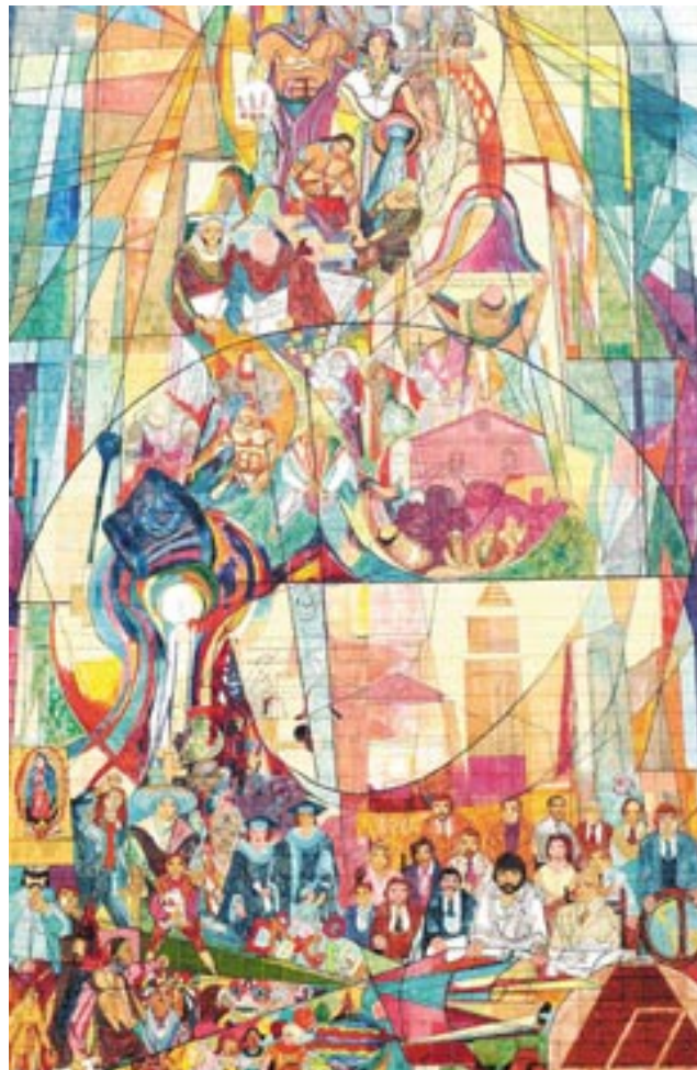
Colorful murals like this one outside the vet center are a signature feature of East Los Angeles.

stories. She wasn't about to let that happen.