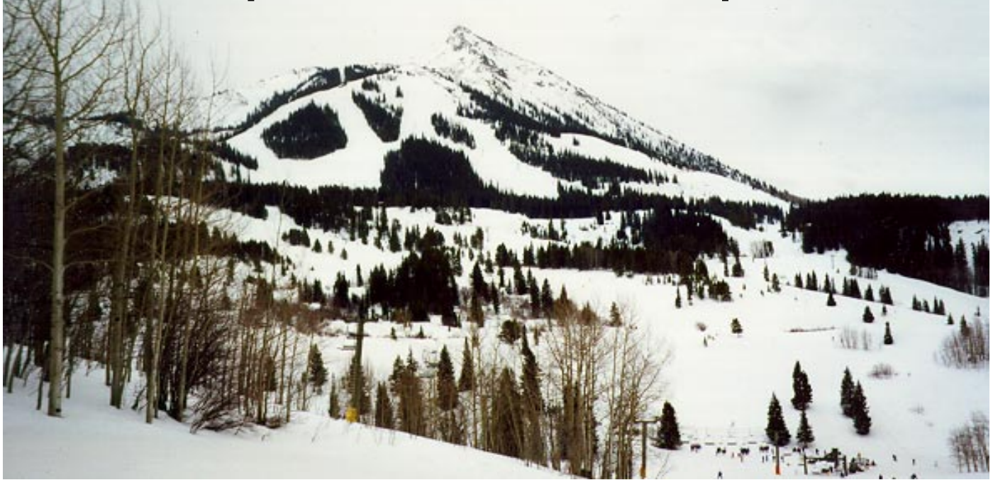
Mt. Crested Butte, Colo., site of the National Veterans Winter Sports Clinic

"I have new respect for the word steep! " Those are the words of a novice disabled skier after finishing his first run down the slopes of Mt. Crested Butte, Colo., at the 12th National Veterans Winter Sports Clinic.