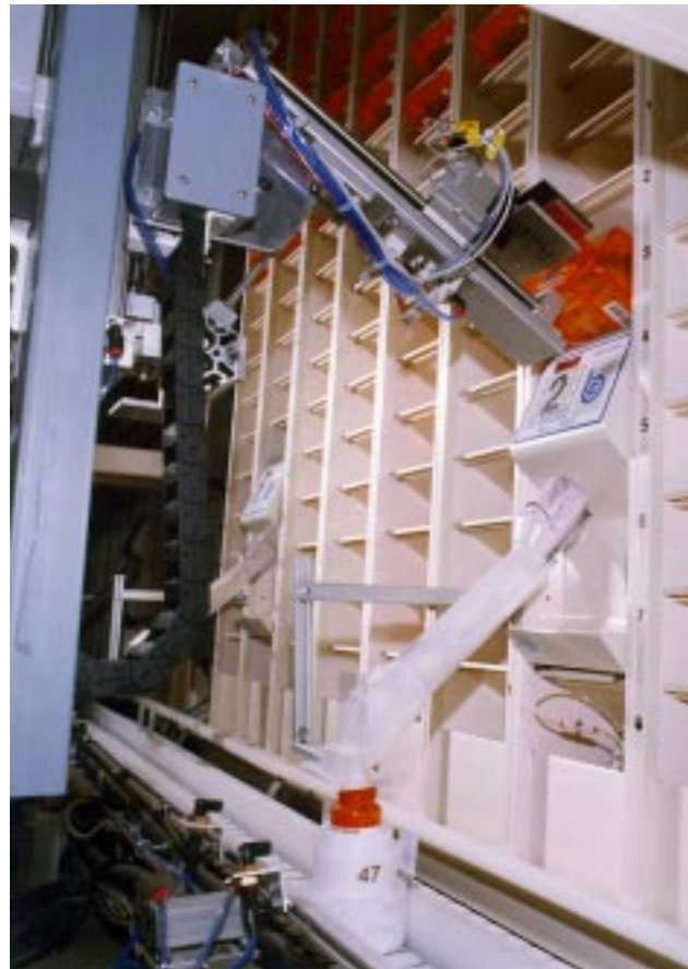
The robotic arm makes automatic placements on a counting device and the correct quantity is dispensed directly into the waiting bottle on the conveyor belt. The bottle then continues to the filling technician who completes the order.

The Wilkes-Barre VA Medical Center's Outpatient Pharmacy