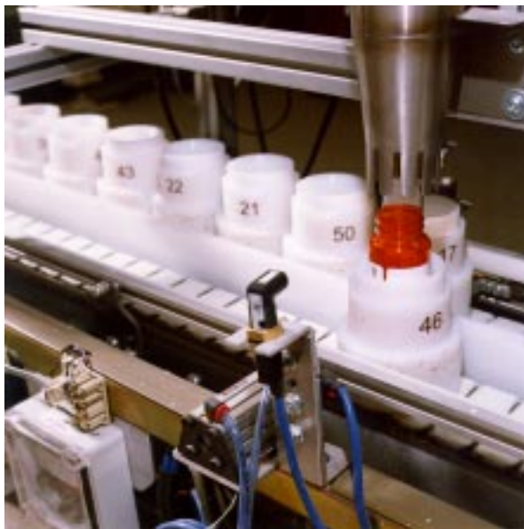
After the Pharmacy Baker 3000 assigns a barcode to a prescription, scans it, generates a label and drops a bottle into the automatic labeler, the bottle goes into a "puck" on the conveyor belt. Each numbered white puck has a unique microchip in it to aid in the tracking of the medication through the filling process.

currently fills an average of 1,800 prescriptions per day. With mail-orders included, that amount will increase to more than 2,000 to meet the demand of the five community-based outpatient clinics under Wilkes-Barre's jurisdiction.