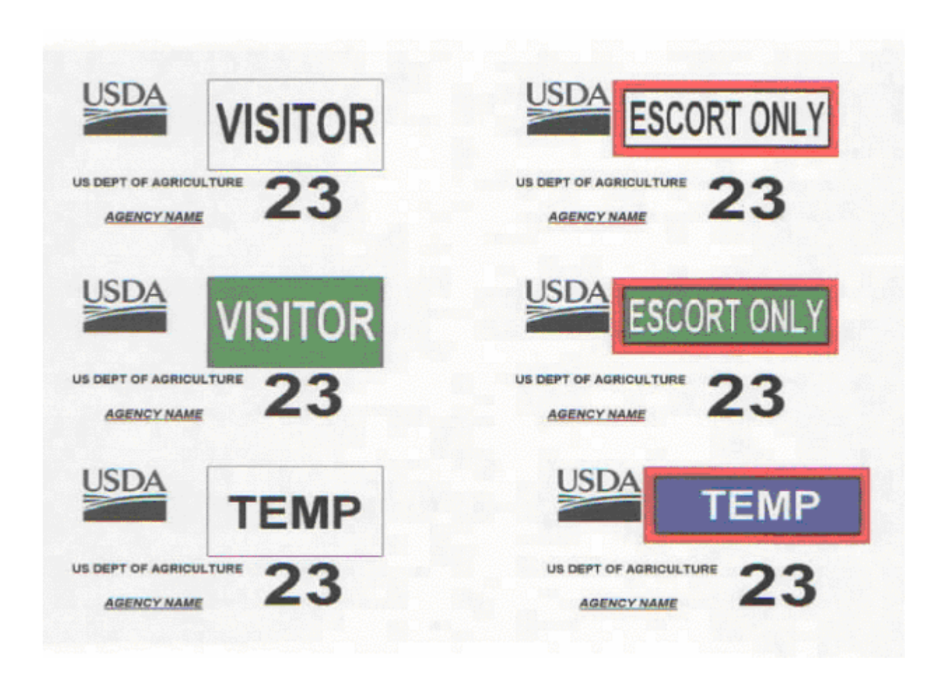
Exhibit 3 continued