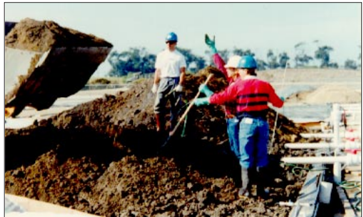
Figure 1. Preparing contaminated soil piles for biopile remediation.

Contaminated soil is placed into engineered piles 8 to 12 feet high and approximately 100 feet long on a waterproof liner (see Figure 1). The microbes' "appetite" is enhanced by blowing air through the contaminated soil pile to provide oxygen and adding fertilizer to provide additional solid nutrients.