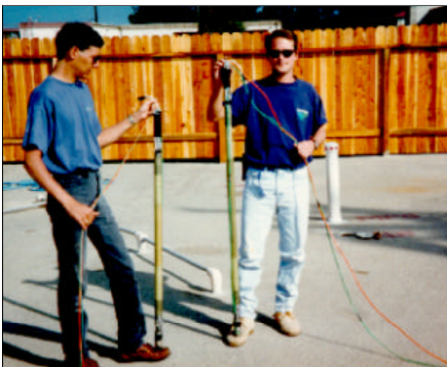
Figure 3. High-impulse borehole radar.

are connected to a data acquisition computer system that supplies real-time data transfer.