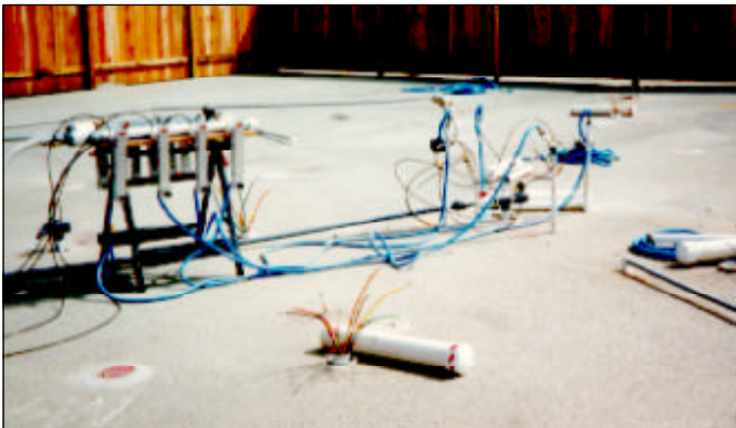
Figure 2. New equipment used to monitor air sparging.