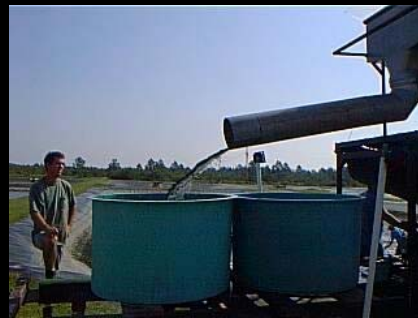
Alabama shrimp harvester