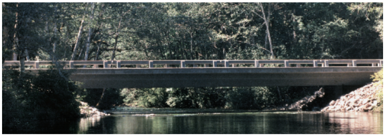
2005 Budget in Brief

Federal Lands Highway Program: The Federal Lands Highway Program (FLHP) improves access to and within national forests, national parks, Indian reservations, and other public lands. The $947 million requested for the FLHP in FY 2005 will support the President's initiatives to enhance the protection of America's national parks and protect these national treasures for present and future generations. This will include enhancement of ecosystems, improvement of outdoor opportunities, improved infrastructure, and greater accountability. The FLHP will also continue to develop and implement two new funding categories - Recreational Roads and Safety - as proposed in SAFETEA.