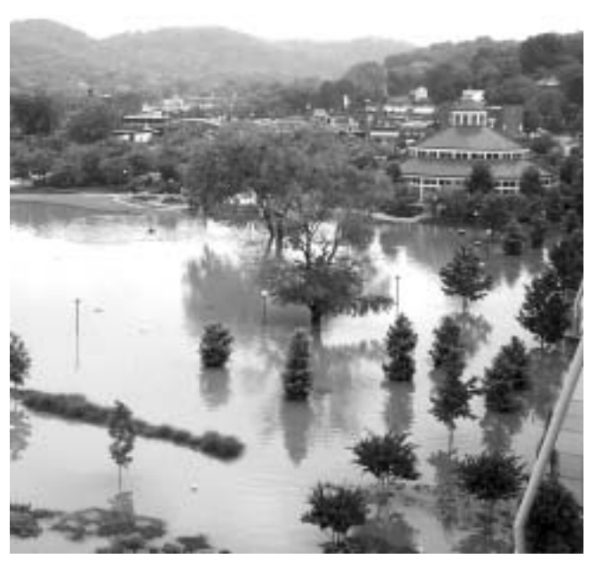
Flooding at Coolidge Park in downtown Chattanooga on May 7, 2003.

The May flood was expensive, causing considerable property damage across the Tennessee Valley. But it could have been much worse. Without the TVA system of dams and reservoirs, the river would have risen much higher and caused more than