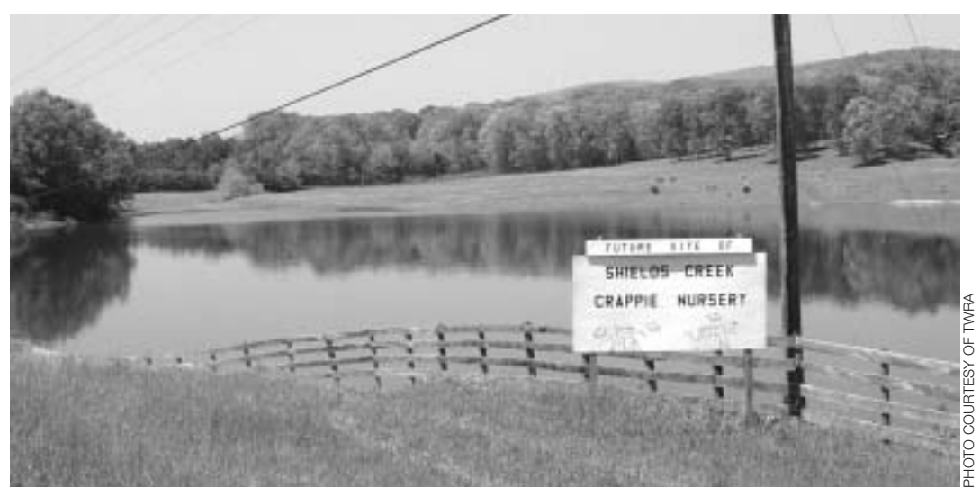
A cooperative effort to develop an impoundment to enhance crappie spawning is currently under way on Cherokee Reservoir. Partners in the Shields Creek Crappie Nursery include TVA's Cherokee-Douglas Watershed Team, TWRA's Eagle Bend Fish Hatchery, and the Cherokee Lake Users Association.

TVA supports recreational fishing through its operation of the river system. Each spring, for example, priority is given to holding reservoir levels steady for a two-week period when bass and crappie come into the shallows to lay their eggs. It is especially important to avoid stranding the eggs above the water line where they would dry out and die. In addition, flows are frequently provided, or releases restricted, to facilitate fish sampling, special studies, fish stocking, and other activities. Since 1992, TVA has provided releases from Watts Bar Dam every spring to benefit downstream sauger reproduction.