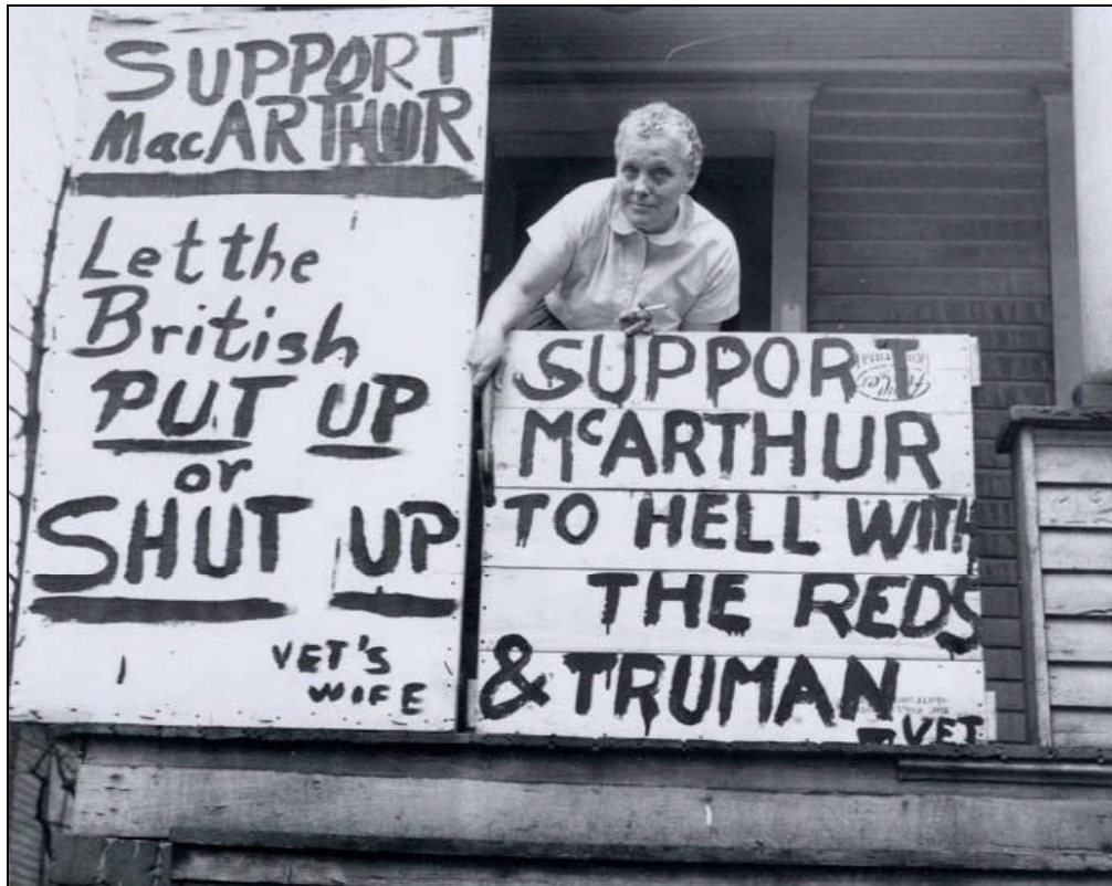
Protest of General MacArthur's Dismissal (, Youngstown Ohio, 13 Apr 51)