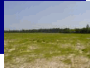
Theodore Stockpile Site