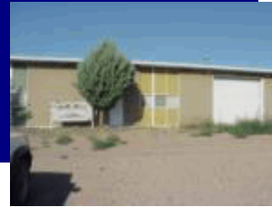
H Marker Facility

State Road 256 (aka Atkinson Rd & Roswell NM