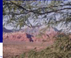
BLM February 2005 Public Auction