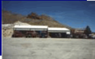
Silverlanes (Bowling Center)