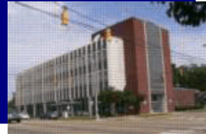
Federal Building - Post Office