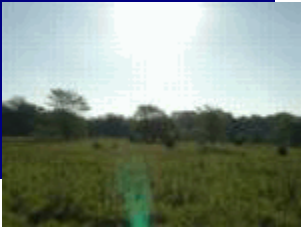
Pattonsburg Lake Project