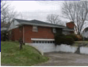
Morehead Ranger District Ranger Residence

420 South Willow Street Morehead KY 40351