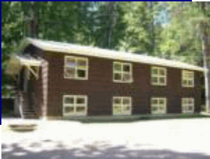
Noxon Administrative Site