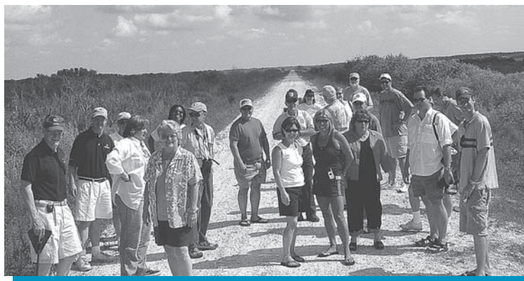
SERIT provided briefings at the Loxahatchee National Wildlife Refuge and Everglades.

The IGFA hosted an evening reception that included updates by several students who participated in the National Student Summit on Ocean Issues in January.