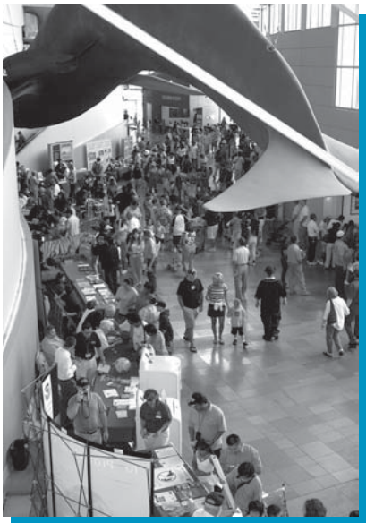
The Aquarium of the Pacific CELC provided extensive Earth Day activities for local school children and communities.