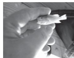
A tiny fish is shown to partners as a healthy indicator of restoration efforts at Munyon Island.