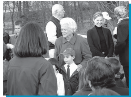
Former First Lady Barbara Bush mingled with CWRP partners and local children at Wells National Estuarine Reserve.

The Coastal America Partnership participated in the 2004 Earth Day Environmental Technology Business Exhibition at the U.S. Department of State. Secretary of State Colin Powell praised the ICWRP pilot project in Sian Ka'an, Mexico, remarking, "If this promising experiment works in the wider Caribbean, the United States is committed to helping introduce the model to other regions of the world as well." (See http://usinfo.state.gov/gi/Archive/2004/Apr/23-529600.html for more information.)