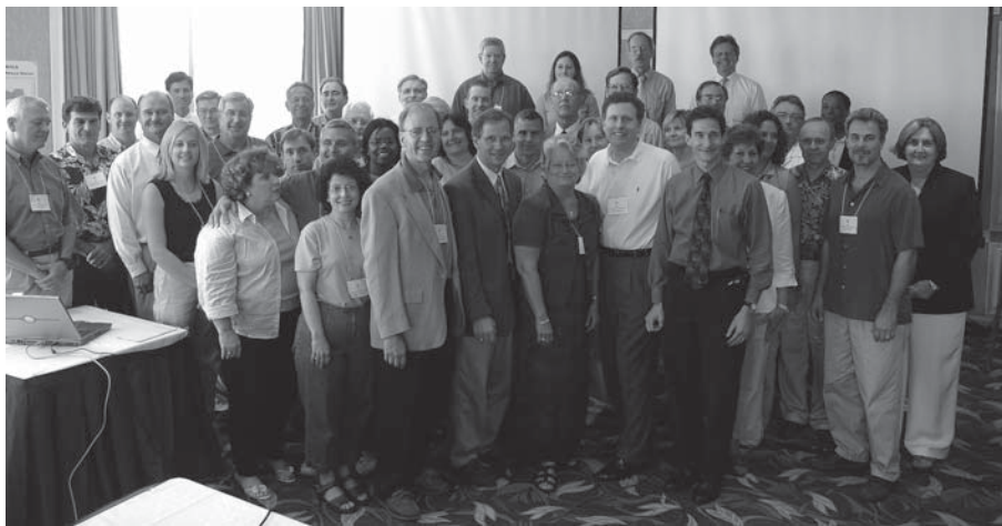
Principals take a break to pose with participants during Strategic Assessment session.