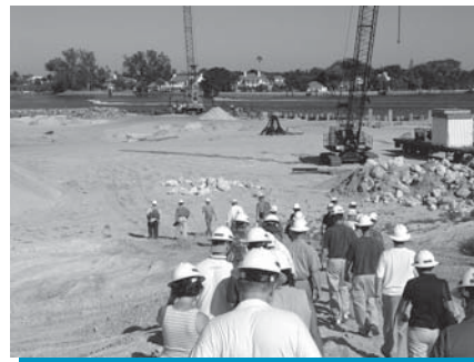
A walking tour and discussion of restoration efforts on Peanut Island.

The IGFA hosted an evening reception that included updates by several students who participated in the National Student Summit on Ocean Issues in January.