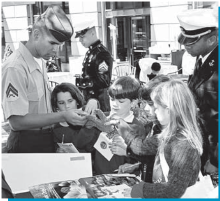
Coastal America partnered with the Navy to teach children about coral reefs, wetlands, and habitat protection.