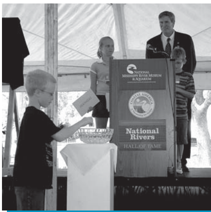
Children poured river water during the Mingling of the Waters.