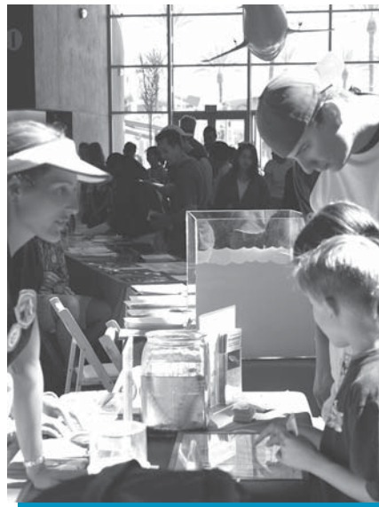
Monterey Bay Aquarium CELC developed Earth Day exhibits to raise children's curiosity in marine science.