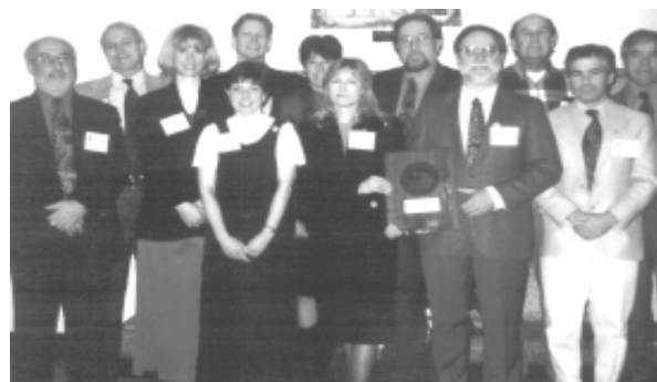
The Alaska Regional Implementation Team Partnership Award Ceremony