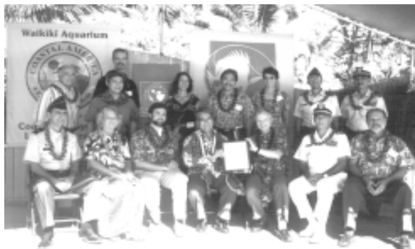
Waikiki Aquarium Designation

On March 17, 2000 the Waikiki Aquarium joined the network of aquariums and marine museums designated as Coastal America Coastal Ecosystem Learning Centers (CELC). The honor, held by only ten other facilities in the U.S., brings with it a partnership with the federal agencies of Coastal America. The Waikiki Aquarium is the first CELC in the Pacific Islands Region, which comprises Hawaii, American Samoa, Guam, and the Commonwealth of the Northern Marianas Islands.