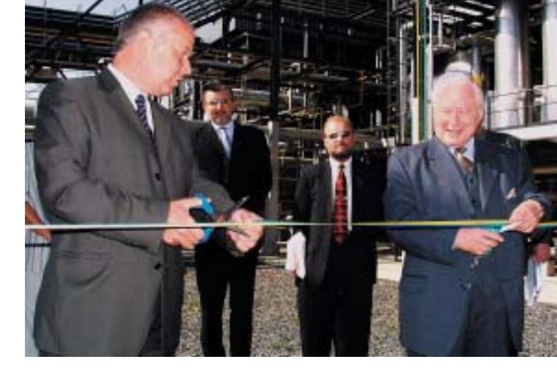
USTDA grants help foreign project sponsors achieve important development goals. Pictured above is the ribbon cutting ceremony for a USTDA-funded project in the chemicals sector in the Czech Republic.

To contact the appropriate Regional Director or Country Manager at USTDA for your country, please call 703.875.4357, fax 703.875.4009, or e-mail info@tda.gov . You can also visit our website at www.tda.gov .