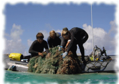
Removing marine debris from reefs in the Northwestern Hawaiian Islands

Coral Reef Conservation Grants Program and Coral Reef Conservation Fund: FY-2003 is the second year that NMFS and NOS have collaborated on these grant programs called for by the Coral Reef Conservation Act of 2000 .