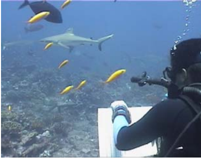
NMFS scientist monitoring coral reef fishes in the Northwestern Hawaiian Islands

Research: NMFS scientists and their partners are supporting targeted research designed to answer key questions necessary to incorporate ecosystem approaches into coral reef management.