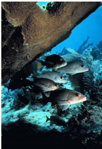
NMFS research is helping understand the ecosystem links between fishes and their habitats

Marine Protected Areas: NMFS is supporting efforts by the State of Hawaii and the Commonwealth of Puerto Rico to evaluate the effectiveness of their coral reef marine protected area systems in partnership with stakeholders.