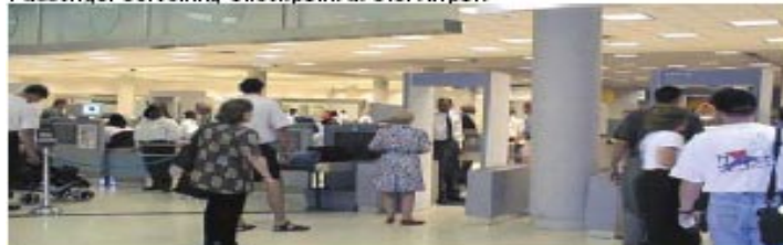
Passenger Screening Checkpoint at U.S. Airport

TSA is also conducting research and development (R&D) activities to strengthen passenger and baggage screening. These efforts are designed to improve detection capability, performance, and efficiency for current technologies, and to develop next generation screening equipment. TSA faces a number of challenges with its R&D program, including balancing funding with competing priorities, and working with other components of the Department of Homeland Security to develop a strategy for merging their R&D programs.