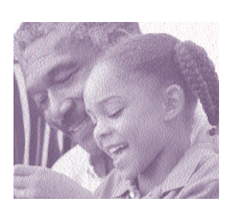
"My family and friends visit often. I'm glad we can have some privacy when we need it."