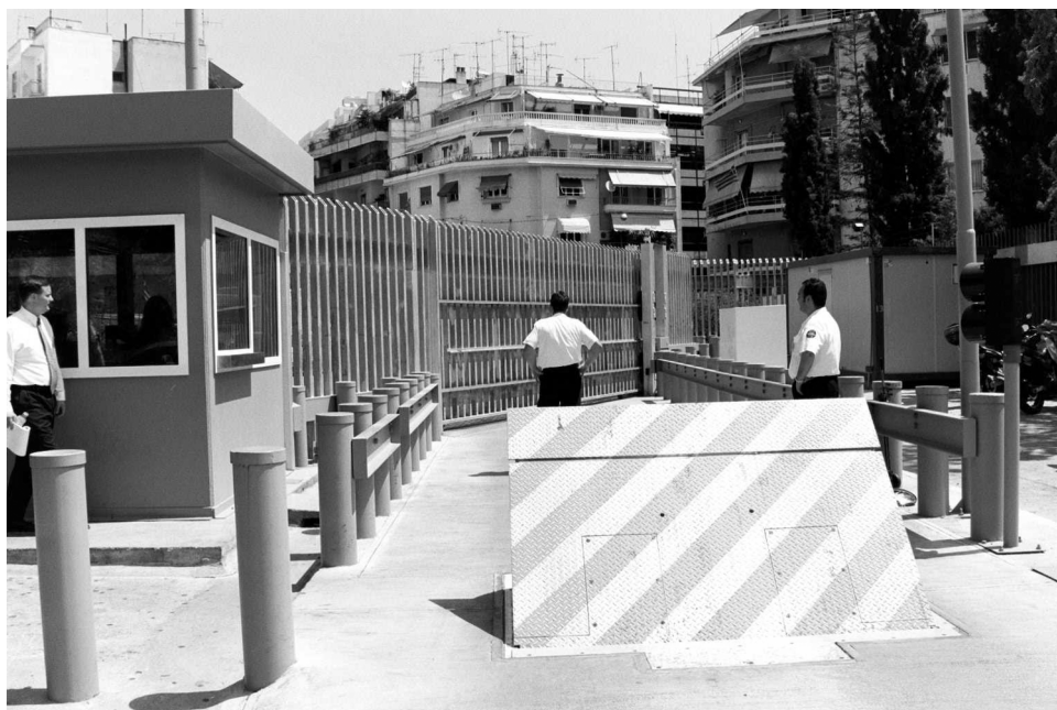
Figure 3: New Security Fence, Gate, and Vehicle Barrier at a U.S. Embassy