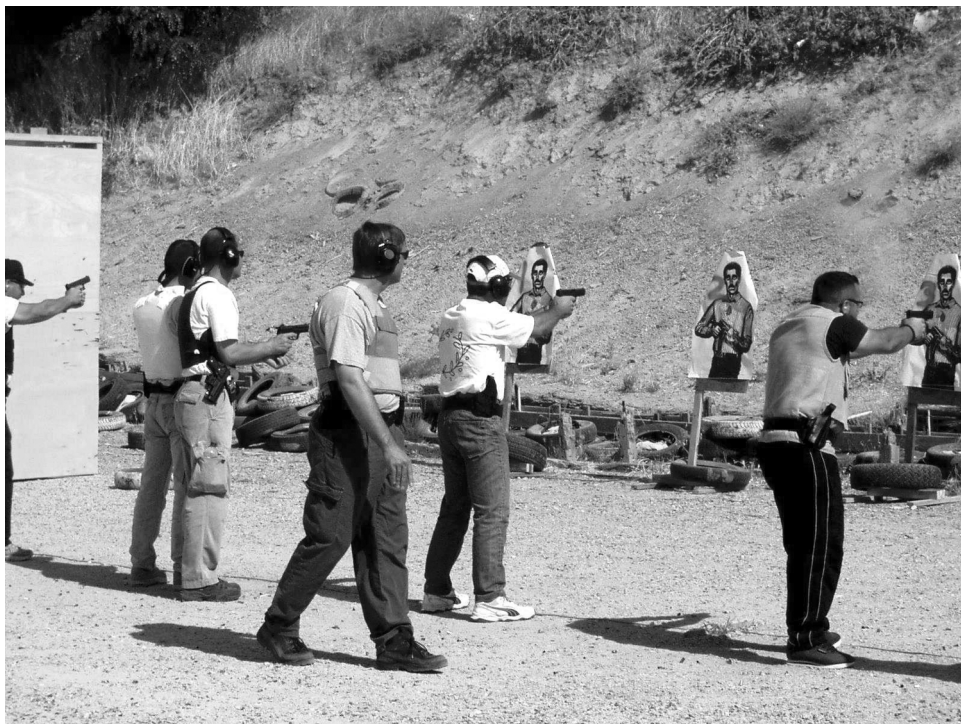
Figure 2: Bureau of Diplomatic Security Training for Local Guards