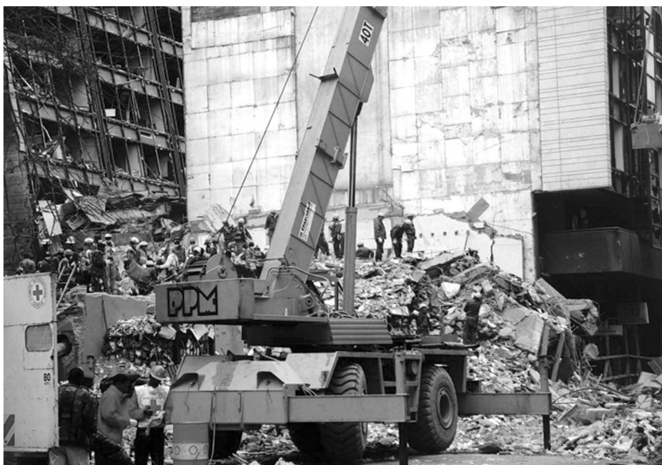
Figure 4: Response to al Qaeda Terrorist Attack, U.S. Embassy, Nairobi, Kenya, August 1998

The State Department is responsible for leading the U.S. response to terrorist incidents abroad. This includes measures to protect Americans, minimize incident damage, terminate terrorist attacks, and bring terrorists to trial. Once an attack has occurred, State's activities include measures to alleviate damage, protect public health, and provide emergency assistance. The Office of the Coordinator for Counterterrorism facilitates the planning and implementation of the U.S. government response to a terrorist incident overseas. In a given country, the ambassador would act as the on-scene coordinator for the response effort. (See figure 4.)