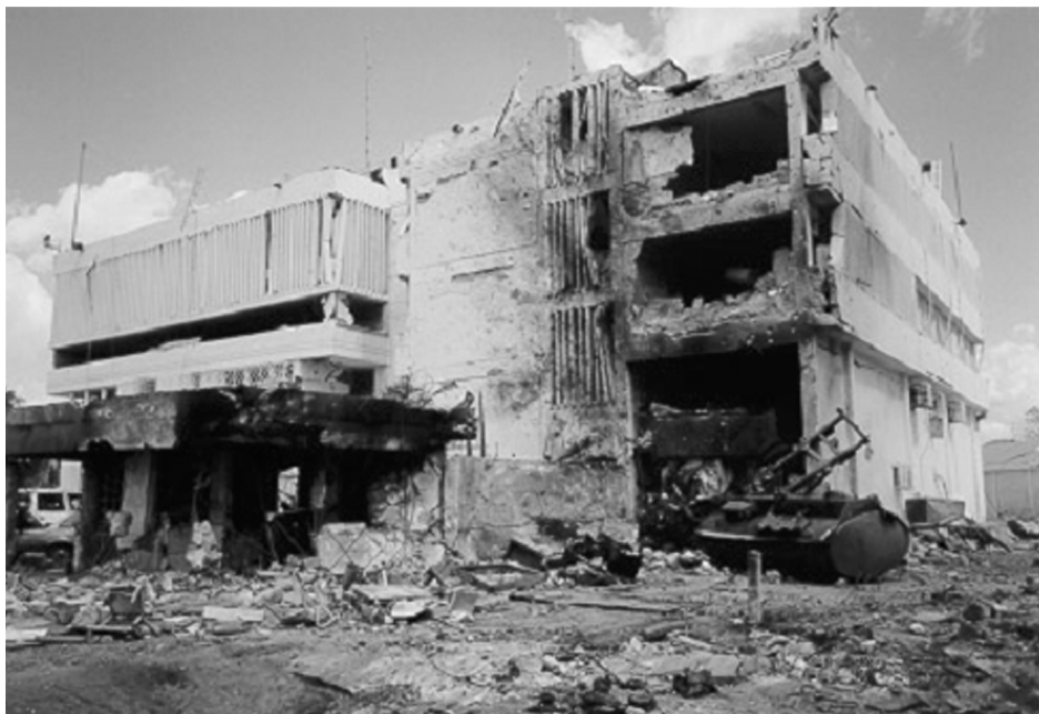
Figure 1: Damage from al Qaeda Terrorist Attack, U.S. Embassy, Dar-es-Salaam, Tanzania, August 1998