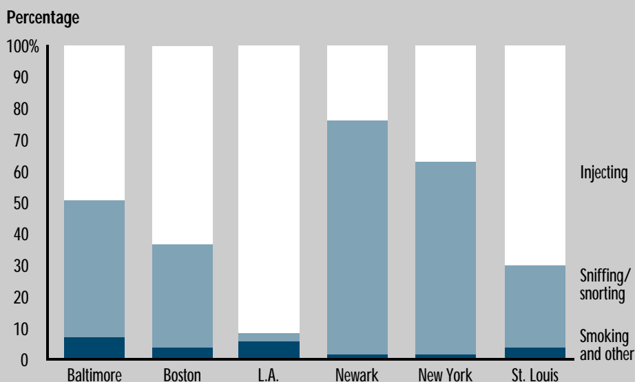
Route of Administration Among Heroin Treatment Admissions in Selected Areas

Source: Community Epidemiology Work Group, NIDA, December 1999