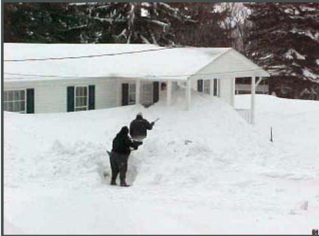
West Virginia residents dig out after the blizzard of 2003.

As a result of the February 14-17 severe winter storm, snow and flooding affected all of the region's states and the District of Columbia. Emergency Operations Centers were activated in all six Region III jurisdictions.