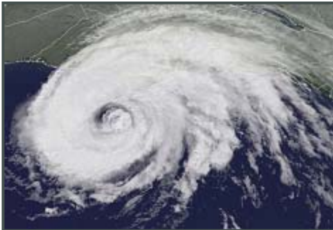
Hurricane Isabel makes landfall on the mid-Atlantic states.

On September 15, the Regional Office began preparations for the response to Hurricane Isabel. The Acting Regional Director called for the activation of the Regional Operations Center (ROC) at Level 1, signifying a massive event. Response Operations reviewed the emergency team rosters and deployed all necessary personnel to the ROC. State Liaisons traveled to the state Emergency Operations Centers. Representatives from ten Emergency Support Functions reported to the ROC. Response staff participated in regular videoconferences with all potentially affected areas. The Governors of all Region III states declared a State of Emergency.