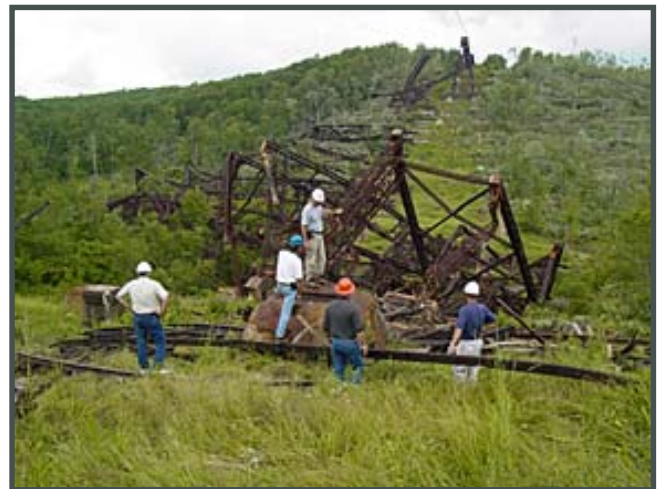
FEMA personnel examine the Kinzua Bridge in Lackawanna County, Pa., after a tornado destroyed it on July 21.