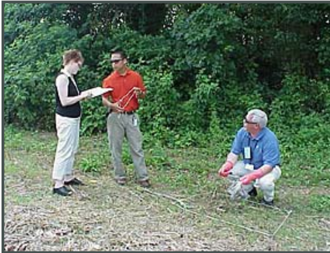
The Virginia Department of Health Office of Water and Radiological Health Program participate in a FEMA-evaluated response exercise at Surry Nuclear Power Plant.