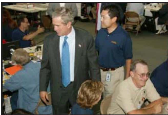
President Bush visits FEMA employees in Richmond, Va. after touring the damage caused by Hurricane Isabel.

The Response and Recovery (RR) Division was extremely active during fiscal year 2003, responding to eleven major disasters and four snow emergency declarations — the most demanding RR year since 1996. In February, a severe blizzard crippled the Northeast, resulting in two major disasters and four emergency declarations in the region. Tropical Storm Henri and Hurricane Isabel caused seven major declarations, requiring intense coordination across the entire region and support from Regions VI, VII, VIII, IX, and X. During fiscal year 2003, the division approved more than $560 million to help residents and their communities recover from the effects of disasters.