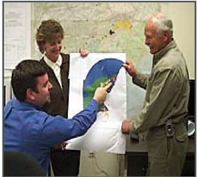
University of Delaware Geological Survey personnel analyze soil data for use in HAZUS earthquake-modeling software.

Region III staff coordinated the pilot HAZUS-MH software program for estimating damage from wind (hurricanes, thunderstorms, tornadoes, tropical cyclones, and hail) and floods (ravine and coastal). During the pilot program, a Flood Information Tool was developed. This software tool uses floodplain boundary information as well