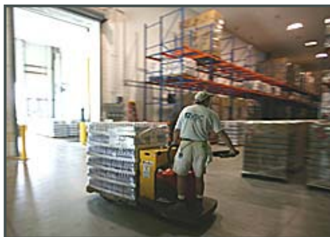
At a Mobile Operations Base, a worker takes water to be distributed to Virginia residents affected by Hurricane Isabel.

Other significant accomplishments include improving