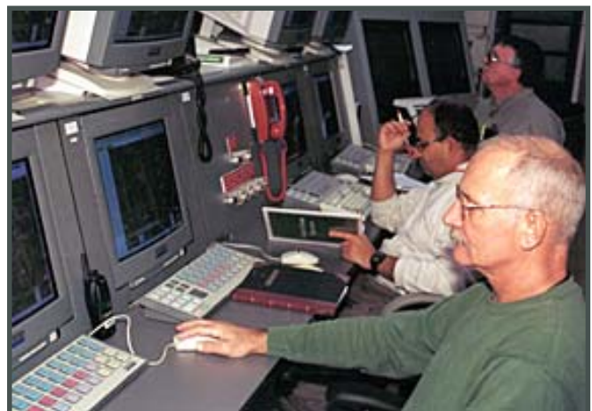
Control room operators study the monitors that enable them to view all neutralization operations at the Aberdeen Proving Ground.