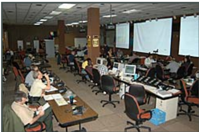
VDEM personnel work at the EOC, which will be replaced soon thanks to a grant from FEMA.

In June, Virginia received a $5,137,000 competitive Phase 2 grant to construct and equip a new Emergency Operations Center.