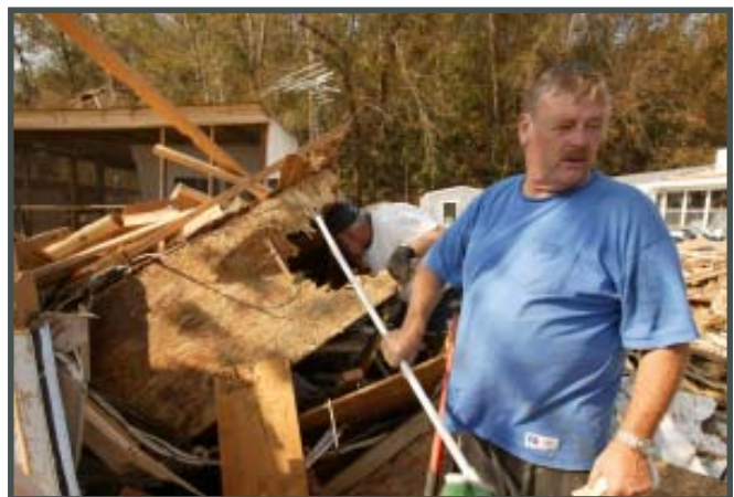
A Virginia resident cleans up the mess Hurricane Isabel left behind.

To date, the Public Assistance Program has approved $278 million for 3600 projects to 235 applicants. Human Services has approved 43,702 applications and dispersed $110,588,046.