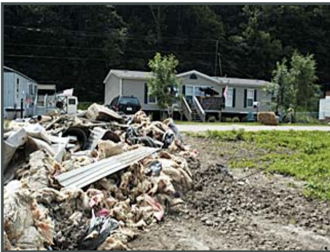
This home, raised above the base flood elevation, received no damage during the June flooding in West Virginia. The flooding devastated many of the other homes in the neighborhood.

The Hazard Mitigation Grant Program (HMGP) has achieved considerable success in the “close out” of 14 disasters during fiscal year 2003. Region III funded 16 projects, totaling $6,357,000. The projects included acquisition and demolition projects, hazard mitigation plan-