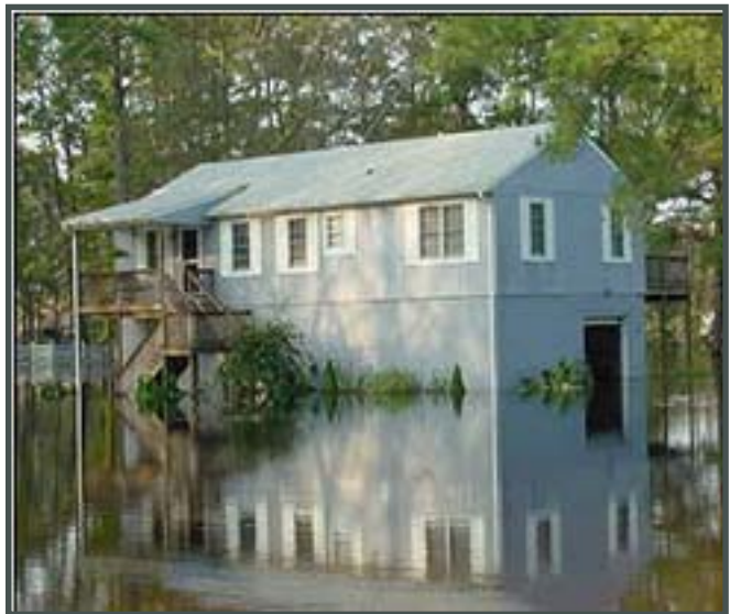
The Stradley elevated residence is out of harms way during flooding caused by Hurricane Isabel.

The Community Assistance Program State Support Service Element (CAP-SSSE) helped the Mid-Atlantic states improve their compliance with the National Flood Insurance Program (NFIP). As a result, FEMA Headquarters has enhanced the NFIP program activities immensely by providing the region with an additional $300,000 for distribution to the states.