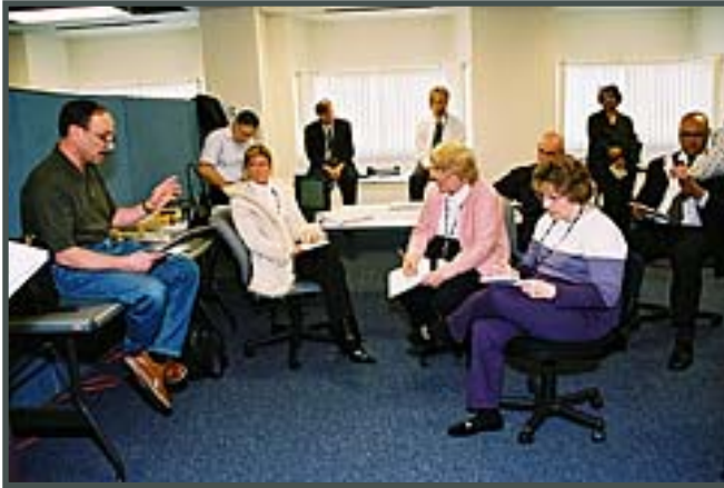
Administration and Resource Planning meet during the ERT NCR exercise.

During fiscal year 2003, Region III's Administration and Resource Planning (ARP) division welcomed a new regional Training Manager and the development of a new, comprehensive training program. The retooled Regional Training Strategy placed emphasis on short-session workshops focusing on strengthening "soft skills." The region contracted Dale Carnegie for twelve such sessions including "Communications", "Improving People Skills", "Creating Positive Change", "Overcoming Stress" and "Time Management." ARP also sponsored larger group classes including effective writing, customer service and effective management communications. The staff accomplished these new initiatives while continuing to support staff participation in FEMA's Leadership Excellence Program, Professional Excellence Program, the Career Enhancement Program and the USDA Graduate School.