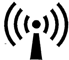
Figure 1. IEC Non-Ionizing Radiation Symbol

IEC 601-1-2 is a collateral standard to IEC 601-1, the general safety standard for medical electrical equipment. IEC 601-1-2 is a good step in the right direction for medical device EMC. It is a general, product-family standard, and contains requirements for both emissions and immunity. It has some very good labeling requirements. For example, the manufacturer is required to provide guidelines for avoiding or identifying and resolving electromagnetic interference. In addition, it requires that the front panel of intentional emitters of electromagnetic energy (e.g. electrosurgery units (ESUs)) be labeled with the IEC symbol for non-ionizing radiation (see Figure 1). IEC 601-1-2 also requires that radiated electromagnetic immunity testing be performed using amplitude modulation at a frequency within each significant signal-processing passband of the device.