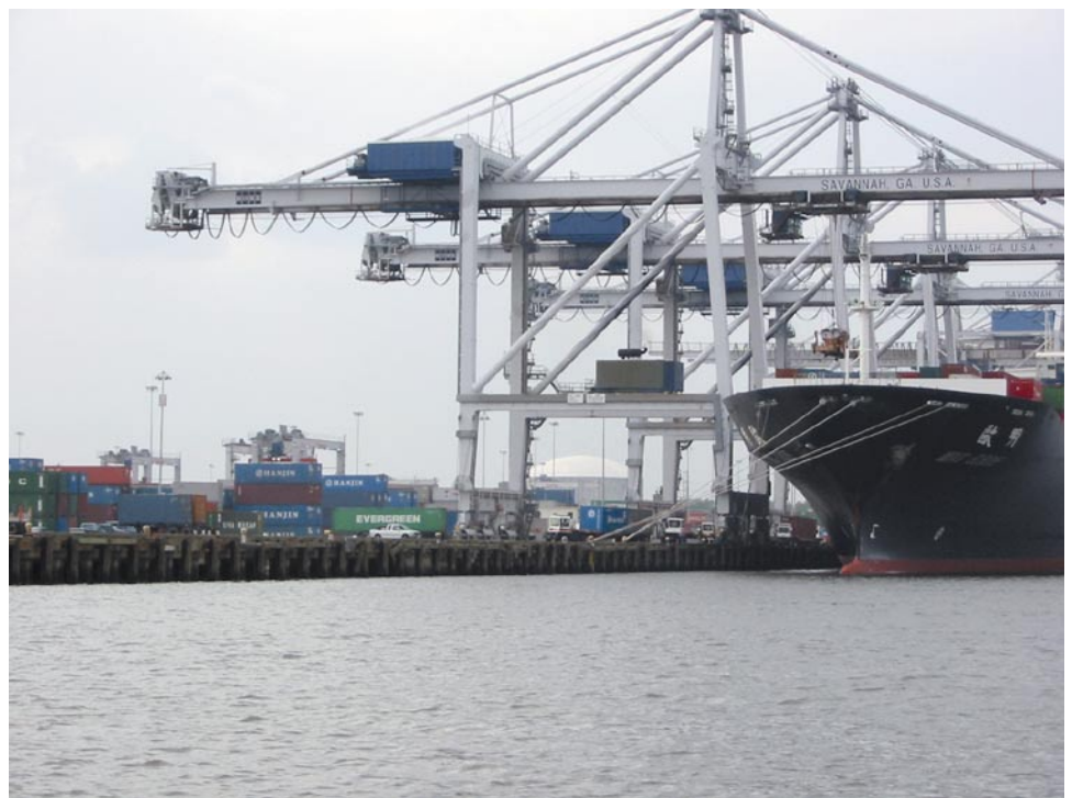
Figure 2: A Commercial Container Vessel and Related Infrastructure at a Seaport

There is a wide range of vulnerabilities at strategic seaports, including critical infrastructure such as bridges and refineries in close proximity to open shoreline, shipping containers with unknown contents, and an enormous volume of foreign and domestic shipping traffic. Figure 2 illustrates typical commercial port infrastructure and operations.