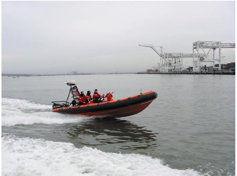
Figure 3: Coast Guard Crew in a Rigid Hull Inflatable Boat Demonstrating Enforcement of a Security Zone at a Commercial Port