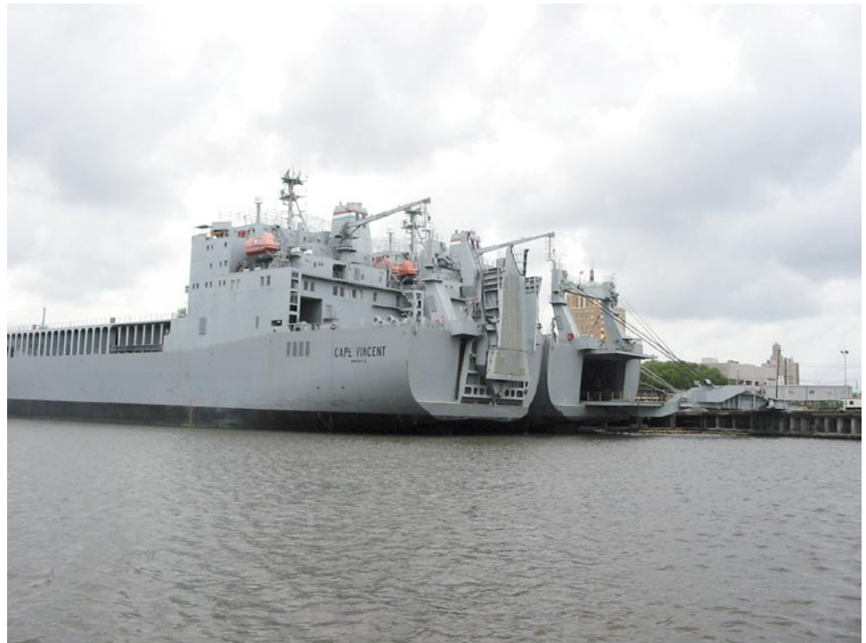
Figure 1: Reserve Sealift Ships Berthed at a Commercial Seaport