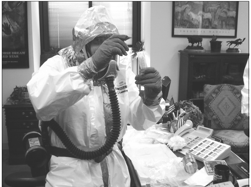
Figure 1: A Sample Is Inserted into a Vial in the Hart Senate Office Building