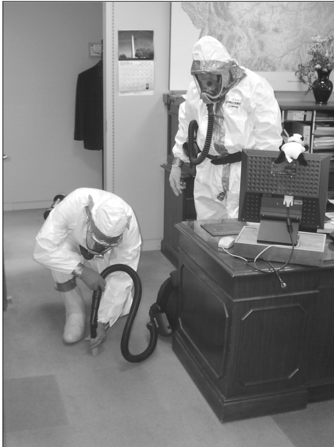
Figure 2: Cleanup Personnel Use a HEPA Vacuum in a Congressional Office