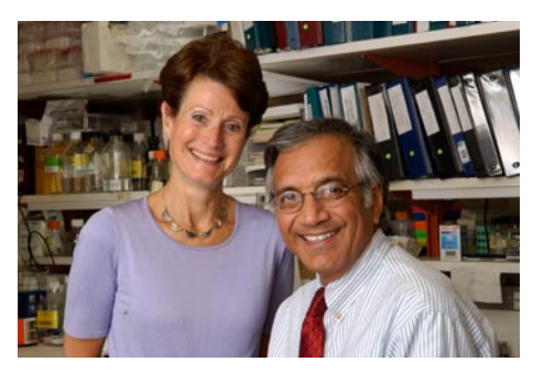
Drs. Dinah Singer and Suresh Mohla

We now know that the tumor microenvironment is an important component of tumor initiation, progression, and metastasis, and as a result, may play prominently in the development of new therapeutic approaches to combating cancer. The tumor microenvironment, or stroma, not only contributes to some of the destructive characteristics of malignant cells, but it also can undermine treatment by partially shielding tumors from thera-