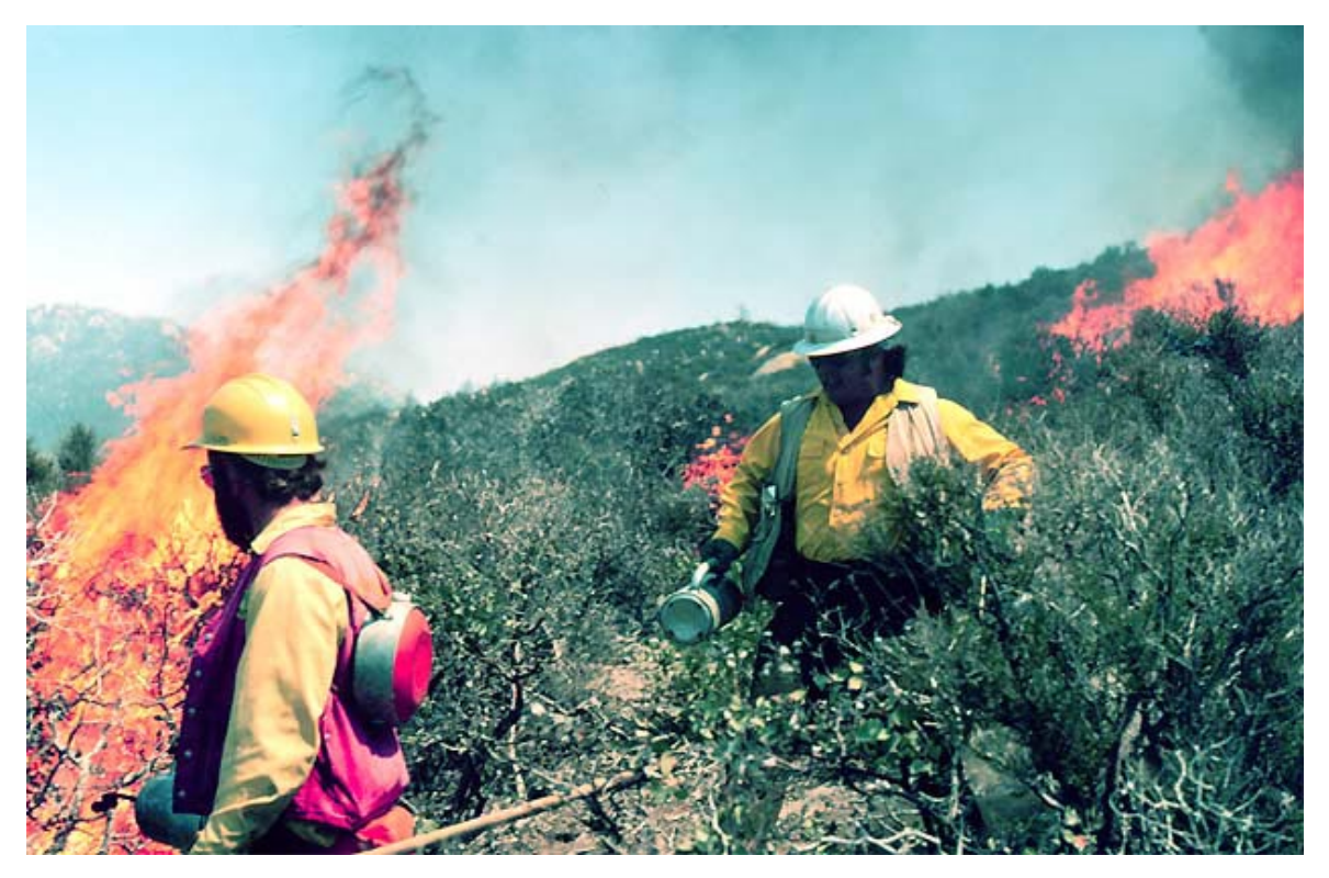
Figure 3. A prescribed burn. The USGS is conducting fire ecology research to guide land managers on the use of fire as a management tool.

research offers opportunities to all divisions. However, the USGS is viewed by the fire community as a new player in fire science. Most existing links are informal and on a person-to-person basis without formal agreements and relationships. There are many informal collaborations with fire scientists in the U.S. Forest Service, other agencies, and academia and with resource managers. The initial barrier to cooperation and expansion of USGS fire science is lack of visibility.