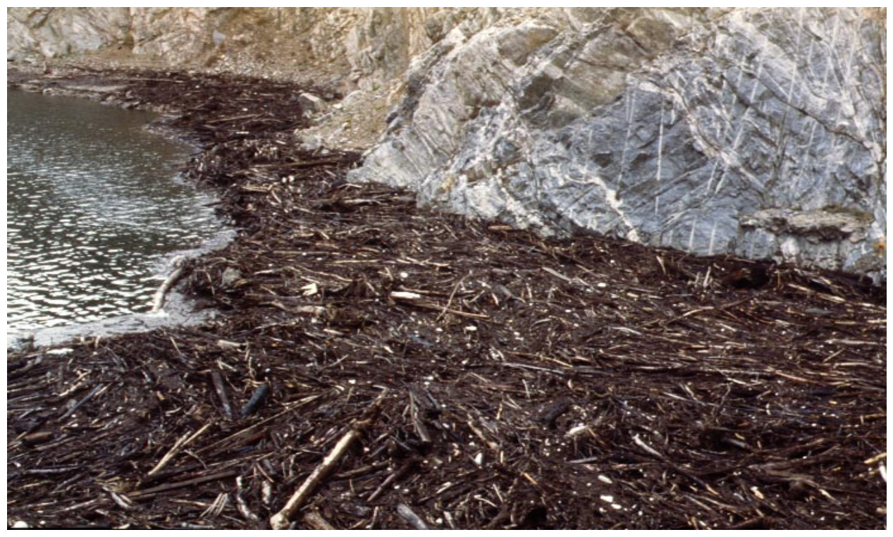
Figure 2. Debris flow at the Strontia Spring Reservoir as a result of the Buffalo Creek, Colorado wildfire. The USGS and the U.S. Forest Service are assessing the long-term impact of wildfire effects in the Buffalo Creek watershed.

interested in studying postfire effects on the hydrological, biogeochemical, and ecological components of watersheds. Julio Betancourt outlined a proposal for a series of startup activities focused at a variety of sites, including areas where large wildland fires occurred in 1996-97, where different methods for mitigating postfire soil erosion (reseeding and contour felling) can be evaluated, where landscape restoration through prescribed burning is being pursued aggressively, and where opportunities exist for paired burned and unburned basin studies.