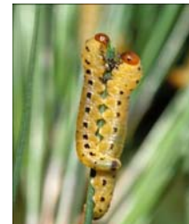
Redheaded pine sawfly larvae

Redheaded pine sawfly – The Michigan DNR has reported high populations of redheaded pine sawfly, Neodiprion lecontei , in young red and jack pine stands in the Upper Peninsula. This is a sawfly species that can be very destructive. Larvae eat both current years needles and older needles. High populations can completely defoliate trees. Pines generally die if they are completely defoliated in early summer. Larvae should be active from mid-June through mid-July. Virus outbreaks often collapse redheaded pine sawfly populations. Private landowners may wish to apply insecticides. For further information view: http://www.na.fs.fed.us/spfo/pubs/fidls/pine_sawfly/pinesawfly.htm