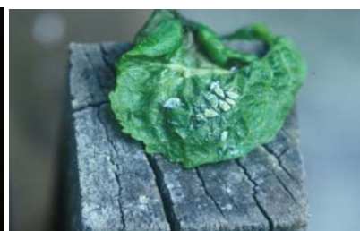
Blackheaded ash sawfly