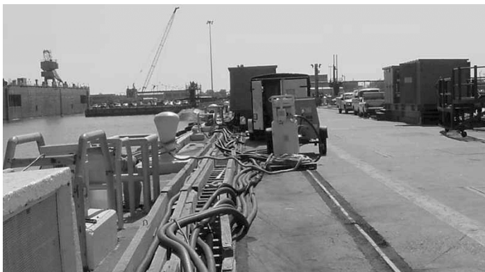
So the wooden troughs are for what?

How many times have you driven through a neighborhood and saw a house that looked like it belonged on wheels? (With an abandoned vehicle; old refrigerator; tires; and knee high grass in the front yard) (Can you say trailer park? I knew you could.) This isn't the image you want your house to portray. Why should the place where you work be any different? We occasionally walk the piers to see how our submarine front yards look and we find a lot of interesting and sometimes unsafe conditions.