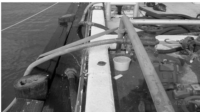
The water should be inside the hose right?