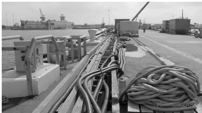
Same place, two months later...Hmmm?