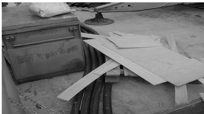
Can we pile anything else on the energized cables?

With all of the different organizations that bring equipment on our piers, it can be overwhelming to keep the pier in a tidy condition. It's up to every boat on the pier to keep the normal daily clutter to a minimum. Don't forget to keep an eye on these organizations at the end of the workday. If you don't, you may have to clean up their mess too!