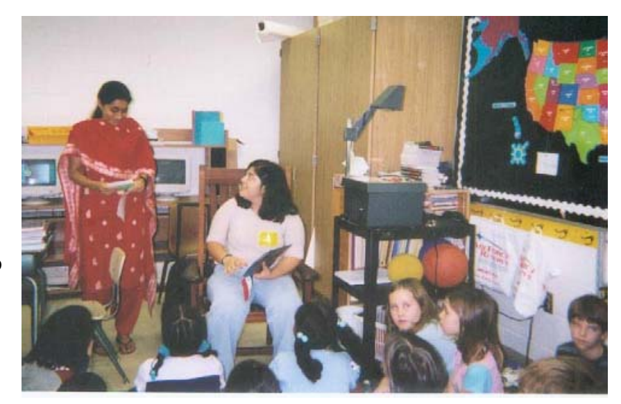
A Pakistani YES student (left) and a Syrian exchange student team up to make an International Education Week 2003 presentation to 4<sup>th</sup> graders at Mary Lin Elementary School in Atlanta, Georgia. They addressed three classes comprising 60 students that day.

The student's participation in the Partnerships for Learning YES exchange initiative exemplifies a goal of ECA to reach into lower socioeconomic levels of society. As the AYUSA International Education Week Contest winner, she will receive a trip on Explore America Tours. Explore America is a leading provider of educational tours for international students and arranges interactive and adventurous travel programs to destinations including New York. California and Hawaii.