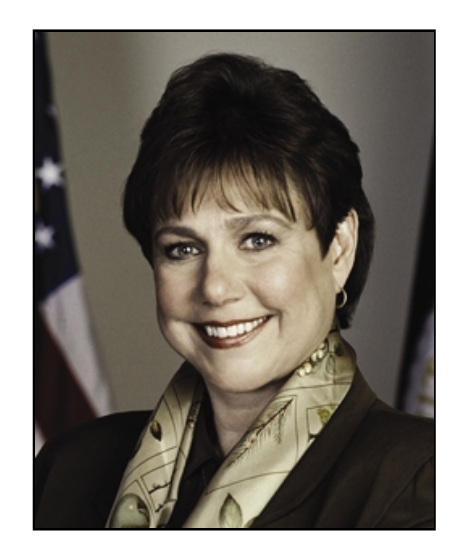
Ann Veneman, Secretary of Agriculture

"One of the President's top priorities is to create new jobs and help spark economic growth. The tax relief package that the President signed into law in 2001 continues to help families throughout America and USDA's Rural Development programs are also creating new opportunities. In 2002, for example, economic grants and loans provided by USDA helped create or protect more than 150,000 rural jobs. As well, Rural Development programs provided more than $12 billion in economic infrastructure grants and loans, helping improve education, healthcare, telecommunications, water treatment facilities, fire protection efforts, and other community centers."