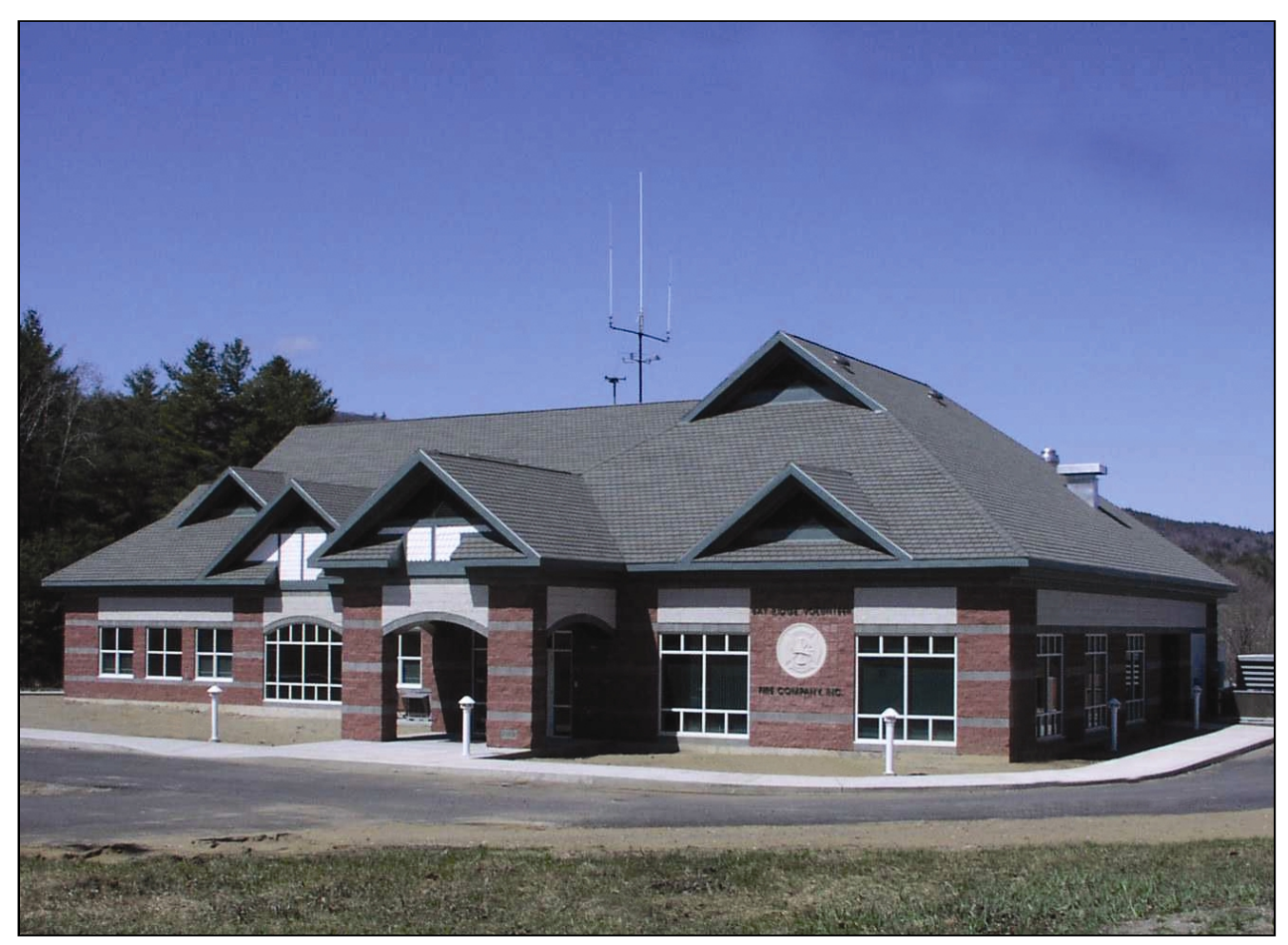
Bay Ridge Volunteer Fire Company, Inc., Queensbury, NY (Warren County), a Community Facilities Guaranteed Loan recipient.