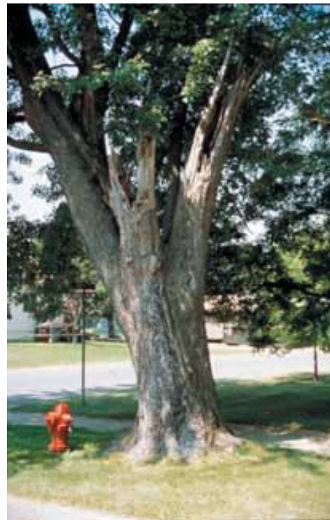
Figure 2.8. This tree has extensive crown dieback, with decayed and broken major limbs. It is a high-risk tree that should be removed.

Identify tree removal and disposal costs. The percentage of total trees surveyed with extensive or total canopy dieback provides an estimate of the number of very high-risk trees that need to be removed (Fig 2.8). Tree removal is typically the most expensive tree maintenance operation on a per tree basis. Costs are based on tree diameter and size, tree density, accessibility factors such as proximity to overhead utility wires, sidewalks, and buildings, and high roadway traffic volume levels. Factor costs associated with stump removal and wood waste disposal into the budget. Explore opportunities to sell the wood to offset removal and clean-up costs. Recent publications provide useful information on successful community wood waste disposal programs (Bratkovich 2001), and guidelines for marketing sawlogs from street tree removal and municipalities (Cesa et al. 1994).