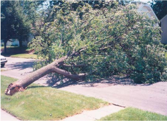
Figure 2.2 - Planting trees too deeply is a primary cause of lower stem decay and subsequent failure. Note there is no root collar flare visible at the base of the trunk. Properly planting this tree so the root collar was level with the soil surface could have prevented this stem failure.

practices, and to inspect trees on a regular basis to detect, assess, and correct hazardous tree defects before they cause tree failures. Aerial and ground examination of trees damaged by Hurricane Andrew (Florida 1992) revealed that inappropriate species composition and improper planting and maintenance practices in urban and suburban areas resulted in extensive and unnecessary tree losses and associated property damage (Dempsey 1994). Field observations following the January 1998 ice storms that struck northern New England, New York, and eastern Canada noted that branch breakage and overall tree damage was much less on trees that were well pruned and well maintained. Johnson and co-workers (1999) found that 84 percent of the trees damaged during high wind storm events had pre-existing defects that resulted in tree and branch failures. They found that most of the pre-existing defects that contributed to tree or branch failure could have been prevented through proper tree planting (Fig 2.2) and pruning practices (Fig 2.3), and could have been detected and corrected if the trees had been inspected for the presence of hazardous defects (Fig 2.4).