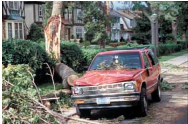
Figure 2.5 - This vehicle was injured by the fallen tree in the background. Note the presence of included bark on the tree's stem (darkened stem tissue where the old branch union existed) that led to the branch failure.

History teaches us that properly maintained trees develop fewer hazardous defects and pose less risk to public safety. Communities can avoid crisis management and establish tree risk management plans that are designed to prevent and correct structural tree defects, before they become hazardous. This management approach requires community leaders and residents to recognize that tree risk management is an issue critical to public safety, and similar in importance to other essential public services such as traffic light maintenance, roadway construction and repairs, sewage disposal, and clean and abundant drinking water. It requires communities to view tree risk management as an investment that can literally save lives (Fig 2.5), and reduce the catastrophic impacts of future storms on community budgets (Fig 2.6) and the health of the urban forest (Fig 2.7).