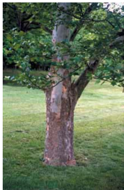
Figure 2.10. This tree, when viewed from one side, displays no serious defects.

Strengths of walk-by inspections. Walk-by tree inspections represent an in-depth evaluation method that provides the level of information necessary to make cumulative decisions about tree defects, site conditions, and the level of risk associated with a given tree to fail and strike a target. To accurately assess the potential risk that a tree will fail, it is important to thoroughly examine the tree and determine the full range of defects and site conditions that are present and could contribute to tree failure. Tree risk assessments should be capable of measuring a variety of risk levels, ranging from low to very high, and should include examination of all sides of the tree including the rooting zone, root collar, main stem, branches, and branch unions. A 360-degree inspection method is especially critical when defects occur on only one side of the tree and might be missed using the drive-by/windshield inspection method. It is not uncommon to find a tree that displays a full, green canopy and/or no major defects when viewed from only one side (Fig 2.10). The same tree, when viewed from the other side, may reveal a serious wound with extensive decay that causes the tree to be at a very high level of risk for failure (Fig 2.11).