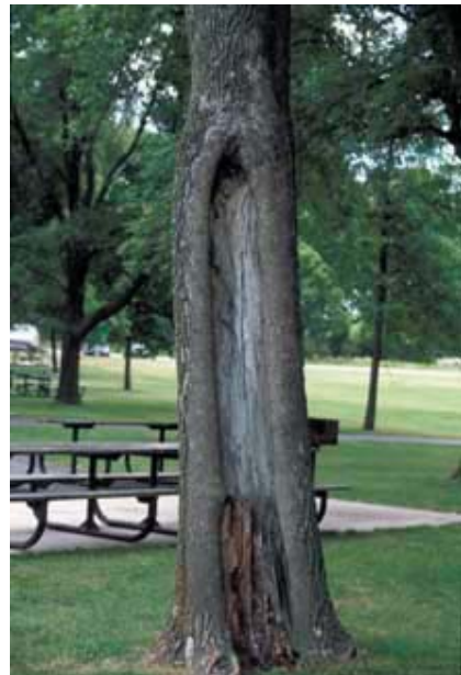
Figure 2.13. The same tree, viewed from the opposite side, displays serious defects: a large stem cavity with extensive decay. These defects and the tree's close proximity to a target make it a very high-risk tree.