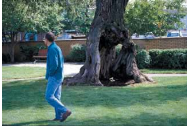
Figure 2.14. The removal or immediate corrective treatment of very high-risk trees must be a top priority within any tree risk management program.

Removal or immediate corrective treatment of very high-risk trees must be the top priority within any tree risk management program (Fig 2.14). It is not uncommon for a community to have a large number of high-risk trees, particularly if a tree inventory survey or tree risk inspections have never been conducted or have not been conducted in recent years. For most communities, limited budgets and personnel will require that corrective actions be implemented or phased in over a period of years. In such cases, the question becomes, “Which of the very high-risk trees should receive corrective treatment first?”