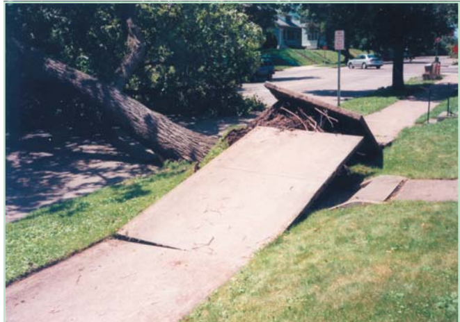
Figure 2.6 - After major storm events, many trees must be removed, replacement trees planted, and extensive sidewalk reconstruction is often necessary.