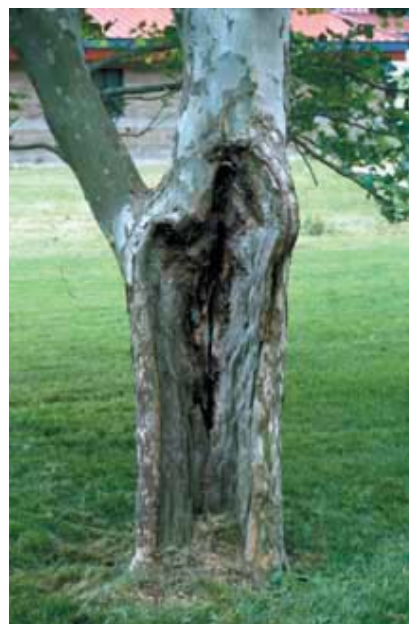
Figure 2.11. The same tree, viewed from the opposite side, displays serious defects: a large stem cavity with extensive decay. These defects and the tree's close proximity to a target make it a very high-risk tree.

Weaknesses of walk-by inspections. Walk-by inspections are more labor intensive and costly to conduct than less intensive methods such as drive-by surveys. Because of the higher cost of implementing walk-by inspections, it may be necessary to limit their use to areas with the highest degree of risk such as very high, high, and moderate risk zones. This could be an effective way