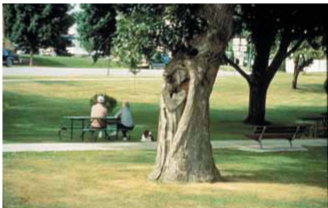
Figure 2.7 - Major stem or limb failures cause large wounds that result in poor tree architecture and predispose trees to wood decay.