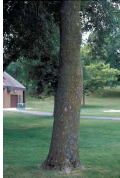
Figure 2.12. This tree, when viewed from one side, displays no serious defects.

Table 2.2 outlines suggested minimum guidelines for inspection methods and inspection schedules within a community tree risk management program. The suggestions contained in this table present a range of inspection options within most