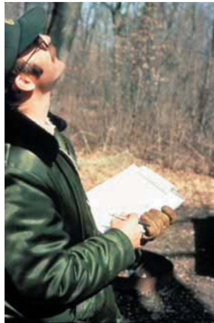
Figure 2.4 - Regularly scheduled tree risk inspections are a valuable tool to detect, assess, and correct hazardous defects, before the tree fails.