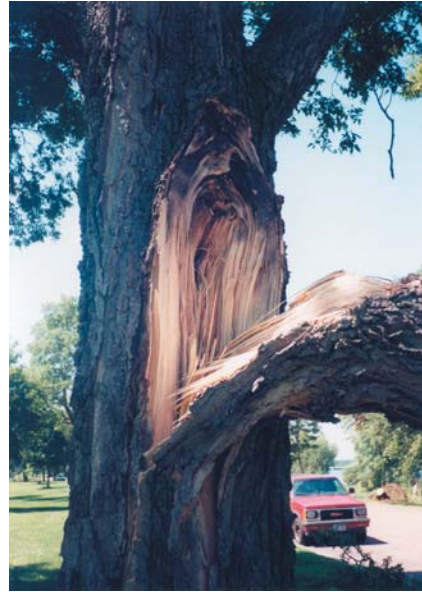
Figure 2.3 - Weak branch unions and the presence of included bark (darkened stem tissue where the old branch union existed) are leading causes of branch failures. Early formative pruning could have prevented this branch failure.

Although storms are commonplace, and the risks trees pose to public safety are often high, many communities operate under a mode of crisis management when it comes to tree care maintenance and correcting/removing trees with hazardous defects. Information from many U.S. cities shows that the cost per unit of maintenance is generally twice as high with crisis