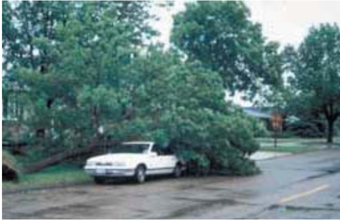
Figure 2.15. All tree failures and significant branch failures should be inspected immediately, documented, and photographed.

of high-risk trees that have been removed since the inception of the program, and demonstrates that the community has materially reduced risk to public safety through the implementation of the tree risk management program.