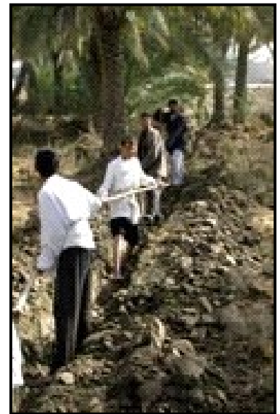
Workers laying pipe in Najaf governorate