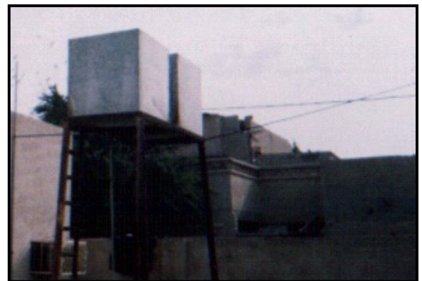
Water tanks installed in a Dhi Qar health care center