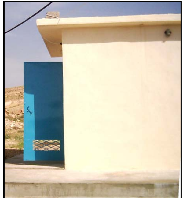
Newly constructed generator building