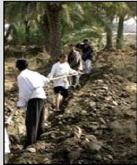
Workers laying pipe in Najaf governorate increasing the access to potable water for 100,000 residents of 17 rural communities.