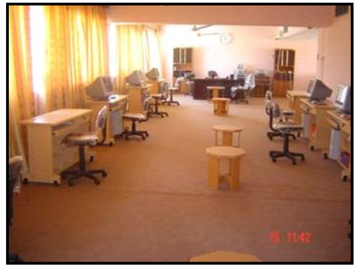
Furniture from a USAID supported vocational school

elections. Women in Iraq are underrepresented in the local and national government. However, future elections present a new opportunity for women to become more involved in the decisions that most affect their lives. These initiatives aim to spur women's interest in entering the political sphere. The grants will cover the costs of hosting these seminars.