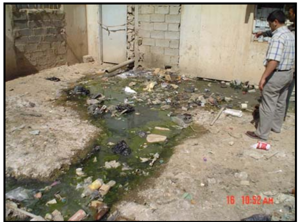
Sewage surrounding an apartment complex before rehabilitation by USAID's Community Action Program