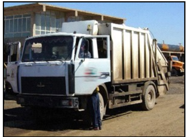
A newly rehabilitated garbage truck in At' Tamim Governorate will help with solid waste collection in urban areas