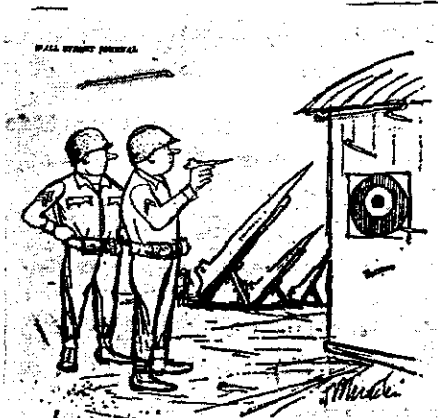
Wall Street Journal