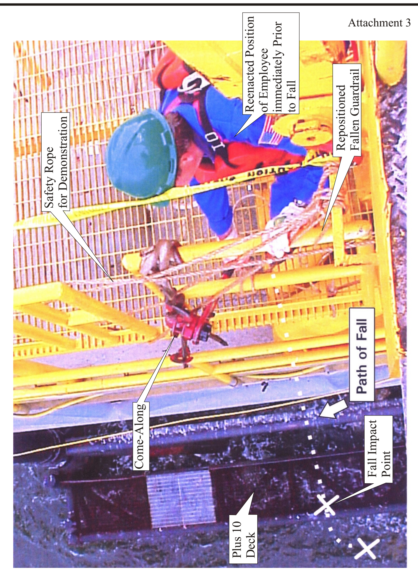
Photograph Demonstrating Fall