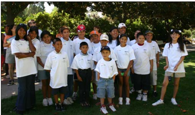
USDA funded International Village in Delano brought a bus full of kids to celebrate Homeownership Month at the Capitol June 16 and see their "Say No to Drugs" posters. Family and friends from USDA housing programs all over the state came to the June 16 Celebration.

USDA Rural Development is an equal opportunity Lender, Provider and Employer. Complaints of discrimination should be sent to USDA Director, Office of Civil Rights, Washington, D.C. 20250