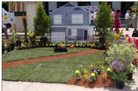
Asociacion Campesina Lazaro Cardenas put together a display of affordable and attractive landscaping and home garden options