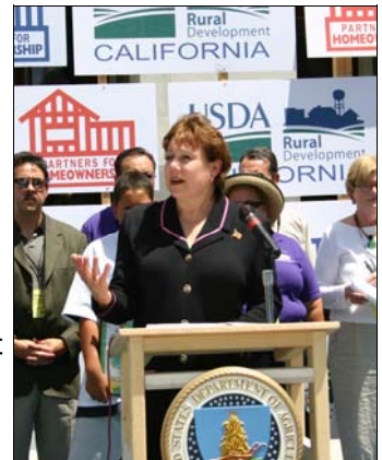
Ann M. Veneman, USDA Secretary addresses the crowd at the Homeownership Month Celebration in Sacramento.